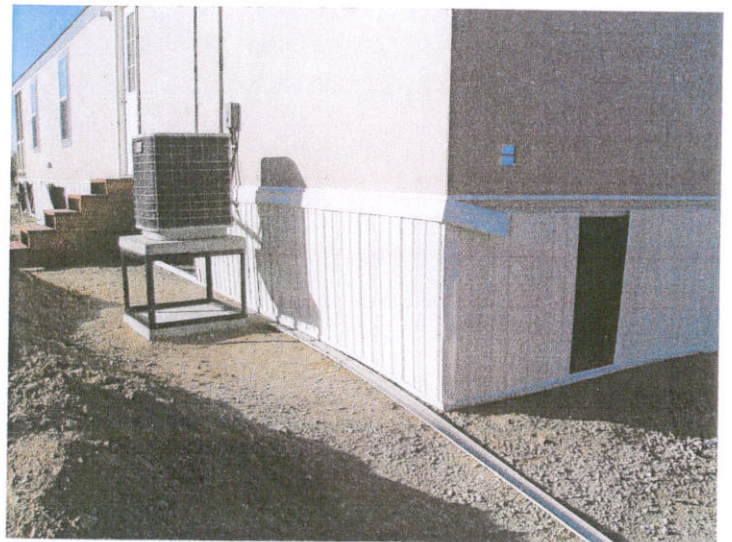
2/20/2009 17660 W. OATMAN NE COR