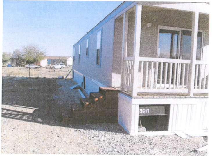
2/20/2009 17660 W. OATMAN SW COR