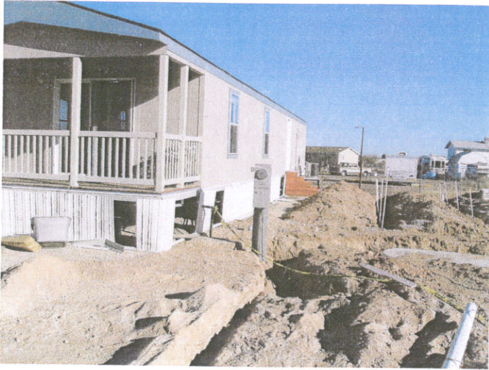
2/20/2009 17660 W. OATMAN SE COR