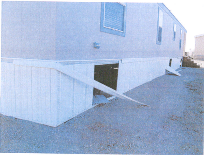
2/20/2009 17660 W. OATMAN NW COR