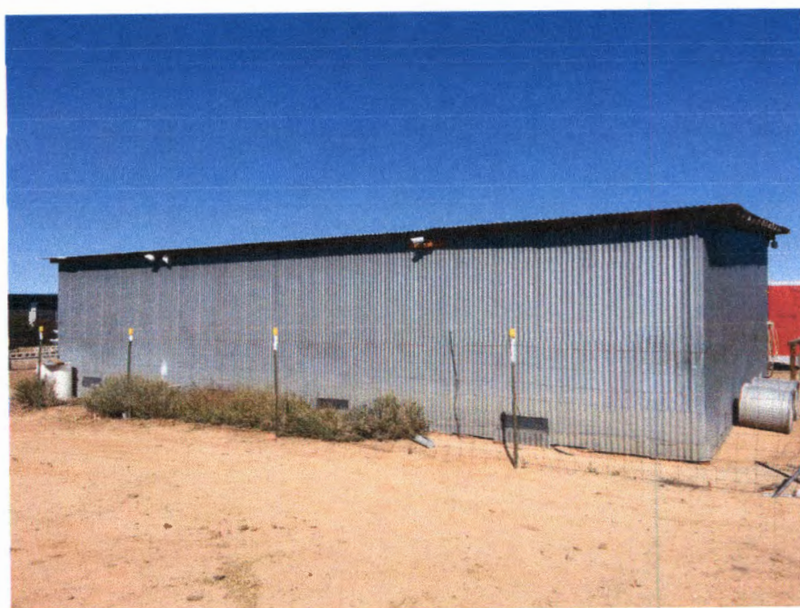
REAR VIEW-SW SIDE 4-8"X2.5' VENTS