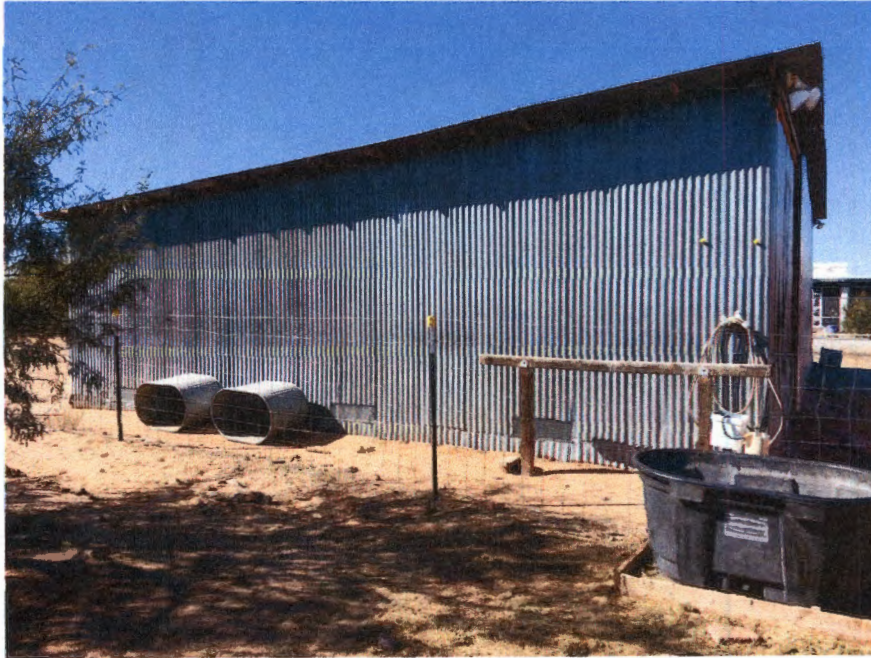
LEFT SIDE VIEW SE -3 8"X2.5' VENTS

If submitting more photographs than will fit on the preceding page, affix the additional photographs below. Identify all photographs with: date taken; "Front View" and "Rear View"; and, if required, "Right Side View" and "Left Side View." When applicable, photographs must show the foundation with representative examples of the flood openings or vents, as indicated in Section A8.