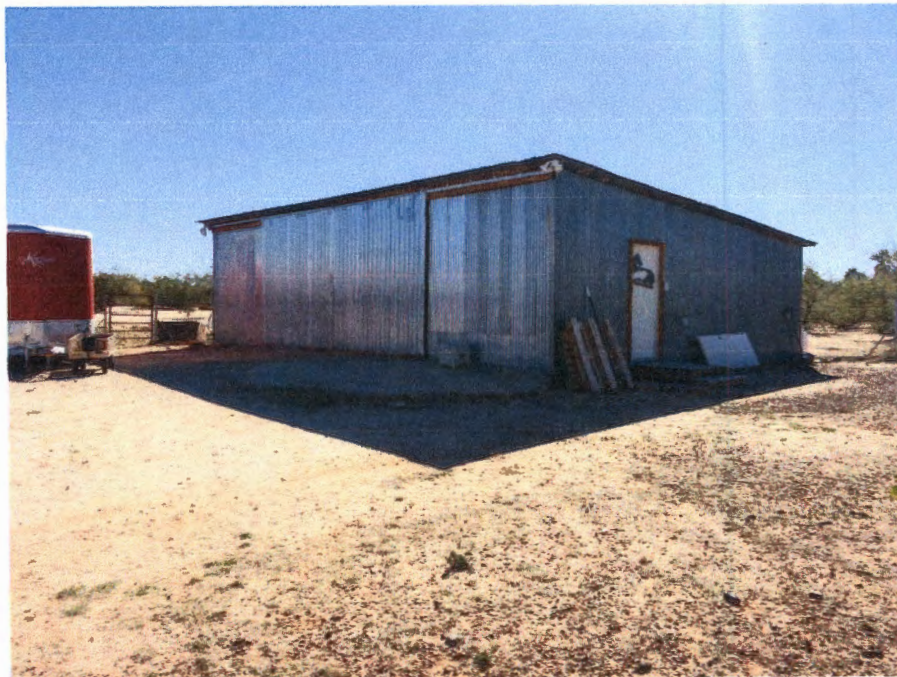
FRONT VIEW-NE SIDE

If using the Elevation Certificate to obtain NFIP flood insurance, affix at least 2 building photographs below according to the instructions for Item A6. Identify all photographs with date taken; "Front View" and "Rear View"; and, if required, "Right Side View" and "Left Side View." When applicable, photographs must show the foundation with representative examples of the flood openings or vents, as indicated in Section A8. If submitting more photographs than will fit on this page, use the Continuation Page.