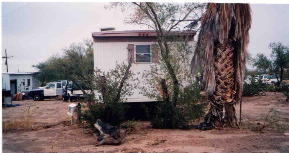
LEFT SIDE VIEW — SOUTHEAST — 12-18-11