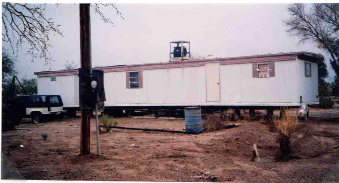
REAR VIEW — SOUTHWEST — 12-18-11

If submitting more photographs than will fit on the preceding page, affix the additional photographs below. Identify all photographs with: date taken; "Front View" and "Rear View"; and, if required, "Right Side View" and "Left Side View."