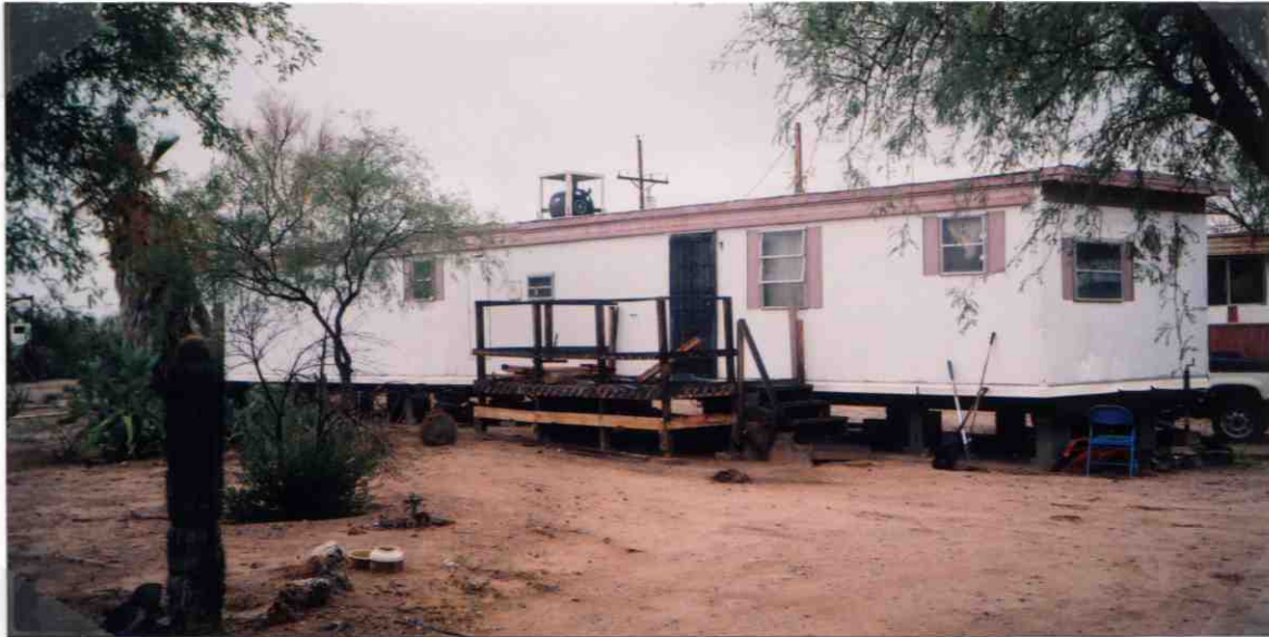
FRONT VIEW — NORTHEAST — 12-18-11

If using the Elevation Certificate to obtain NFIP flood insurance, affix at least building photographs below according to the instructions for Item A6. Identify all photographs with: date taken; "Front View" and "Rear View"; and, if required, "Right Side View" and "Left Side View." If submitting more photographs than will fit on this page, use the Continuation Page on the reverse.