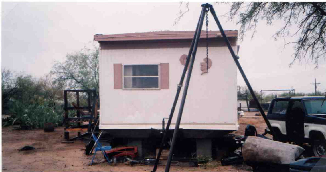
RIGHT SIDE VIEW — NORTHWEST — 12-18-11