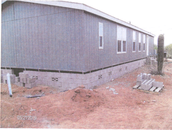
5/21/2009 6568 N WHITE DEER SE COR