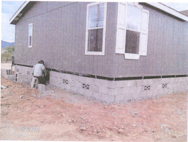
5/21/2009 6568 N WHITE DEER NW COR