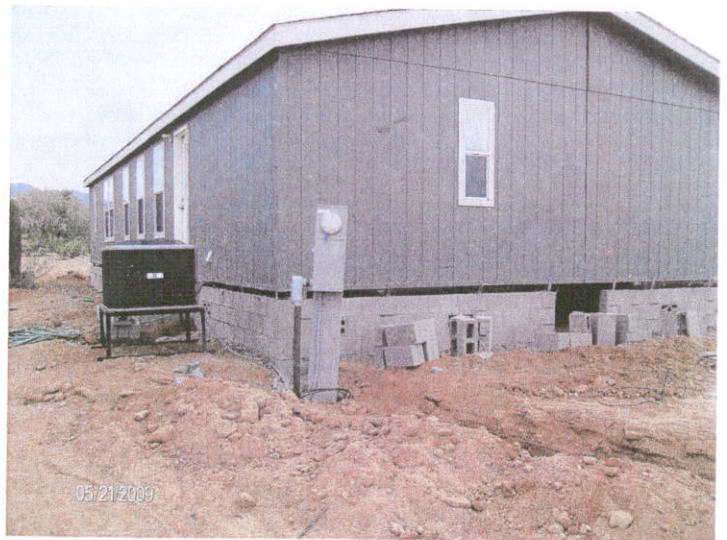
5/21/2009 6568 N WHITE DEER NE COR