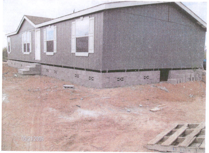
5/21/2009 6568 N WHITE DEER SW COR