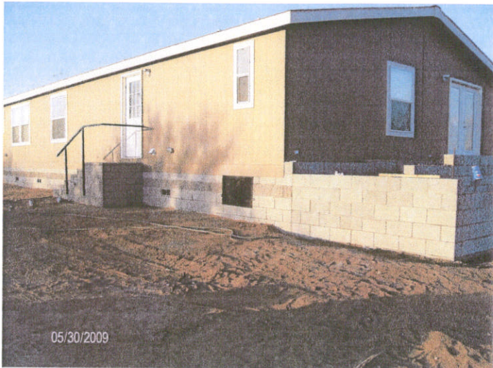
5/30/2009 15260 W CHUMBLERS NE COR