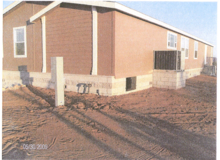
5/30/2009 15260 W CHUMBLERS SE COR