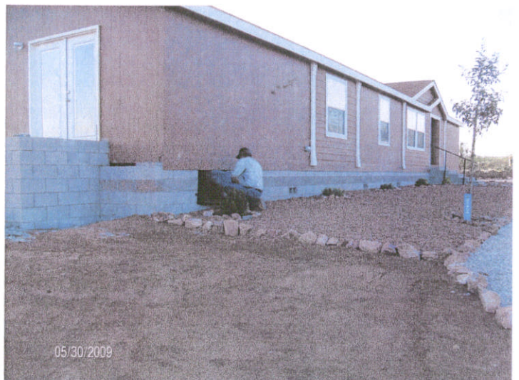
5/30/2009 15260 W CHUMBLERS NW COR