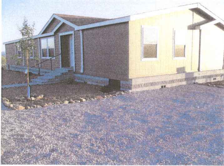
5/30/2009 15260 W CHUMBLERS SW COR