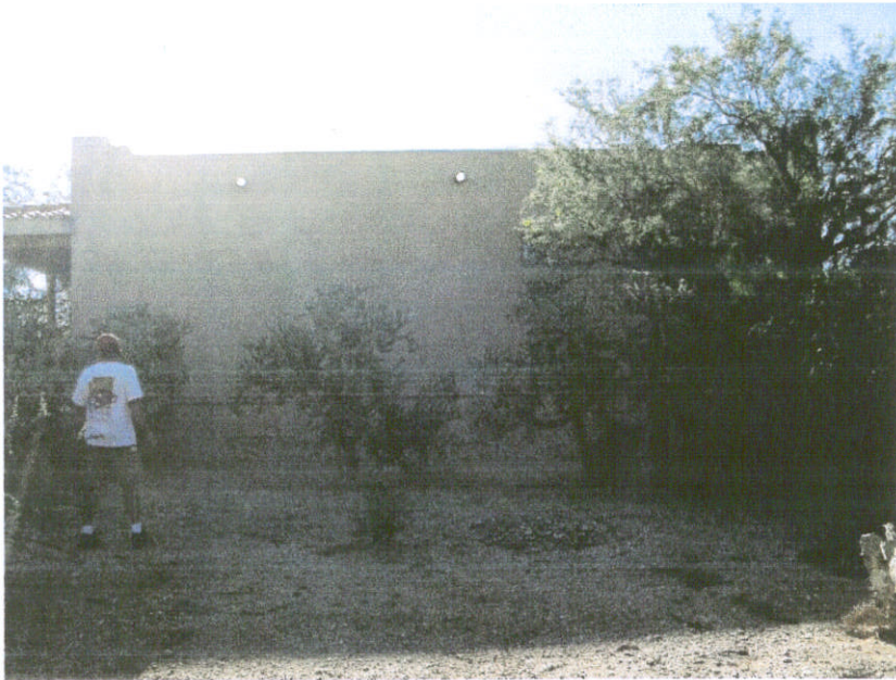
Rear View (west side)