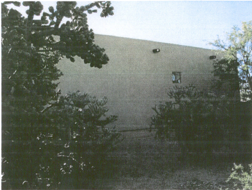
Rear view (west side)