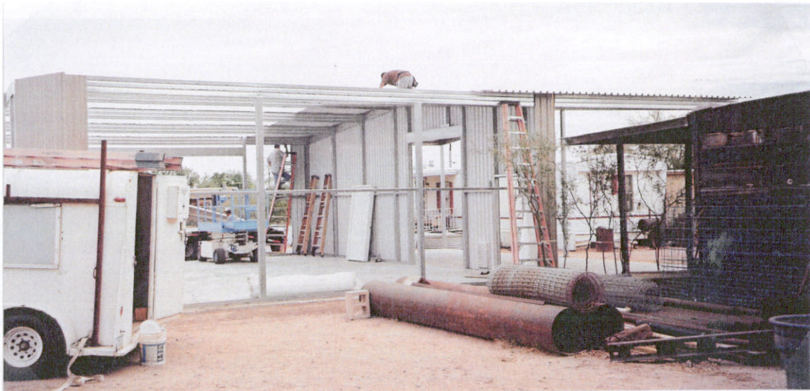
REAR VIEW - SOUTH - 7-24-09

If submitting more photographs than will fit on the preceding page, affix the additional photographs below. Identify all photographs with: date taken; "Front View" and "Rear View"; and, if required, "Right Side View" and "Left Side View."