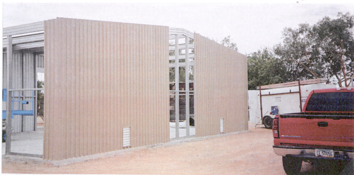
RIGHT SIDE VIEW - WEST - 7-24-09