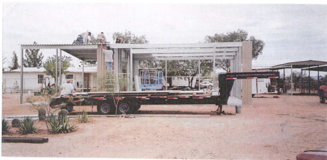
FRONT VIEW - NORTH - 7-24-09

If using the Elevation Certificate to obtain NFIP flood insurance, affix at least Four building photographs below according to the instructions for Item A6. Identify all photographs with: date taken; "Front View" and "Rear View"; and, if required, "Right Side View" and "Left Side View." If submitting more photographs than will fit on this page, use the Continuation Page, following.