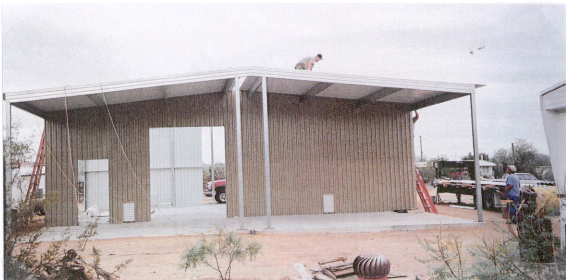
PO LEFT SIDE VIEW - EAST - 7-24-09