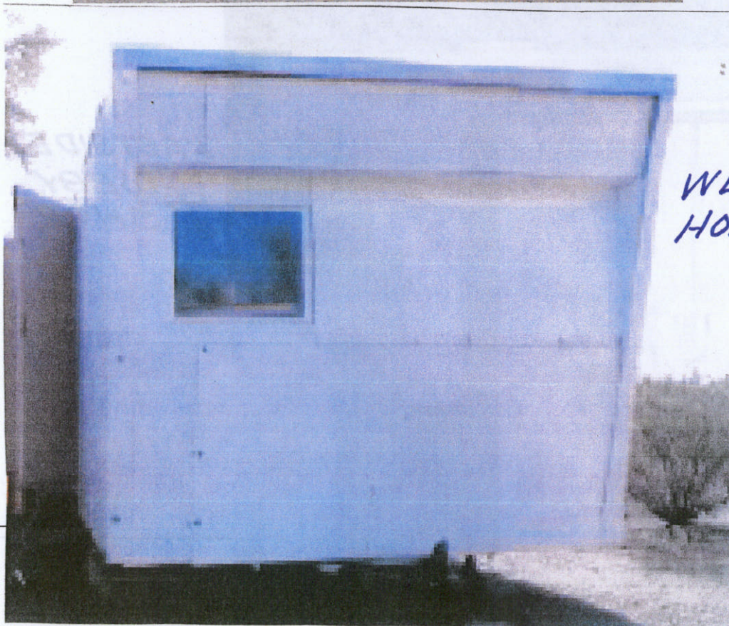
WESTSIDE HOBBY SHOP