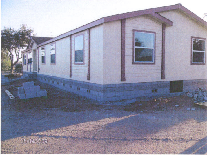
8/9/2009 12300 N ANWAY SW COR