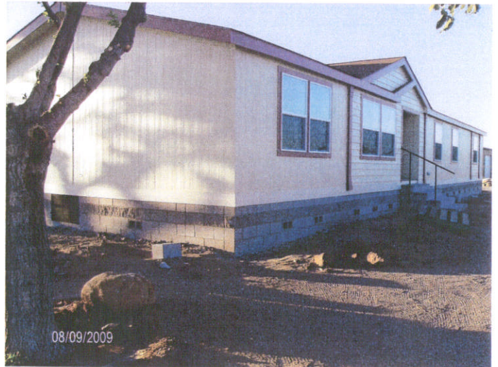
8/9/2009 12300 N ANWAY NW COR