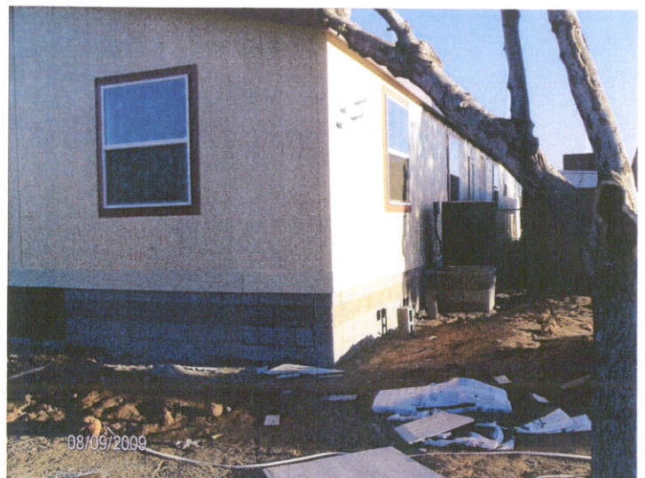
8/9/2009 12300 N ANWAY SE COR