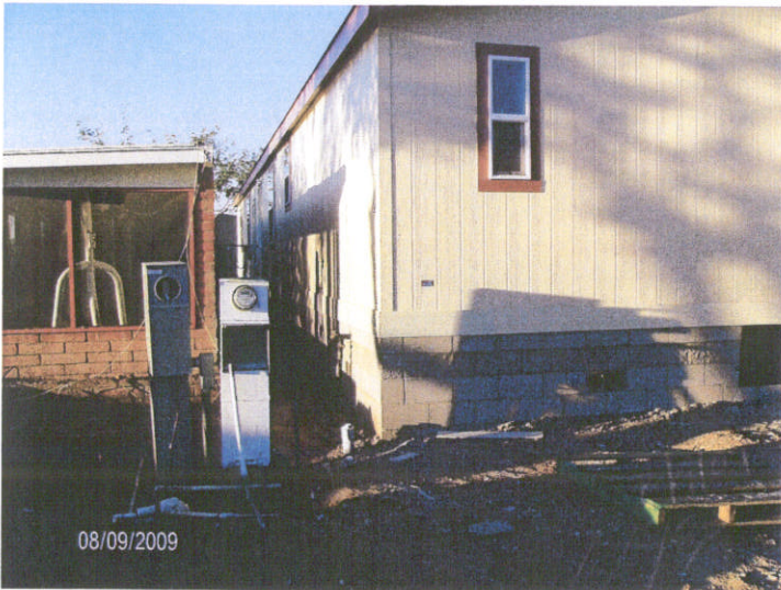
8/9/2009 12300 N ANWAY NE COR