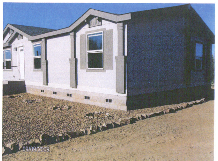
9/9/2009 3924 S ALDON RD NE COR