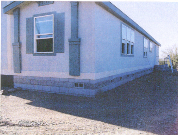
9/9/2009 3924 S ALDON RD NW COR