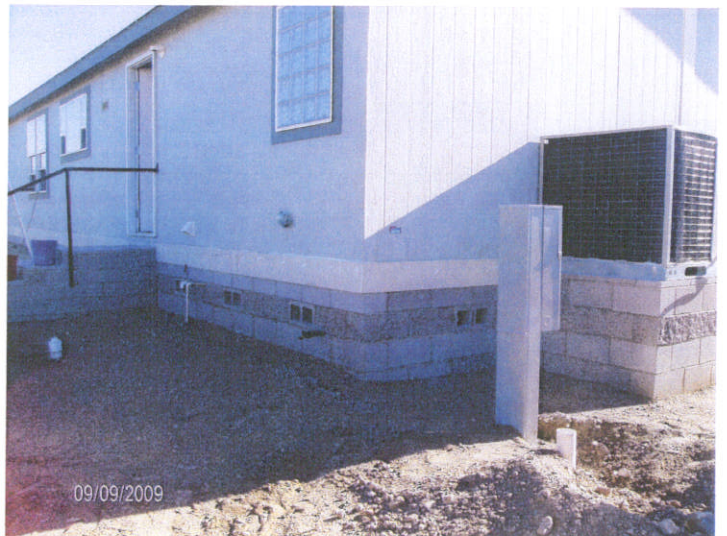
9/9/2009 3924 S ALDON RD SW COR