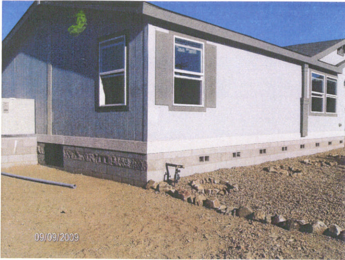
9/9/2009 3924 S ALDON RD SE COR