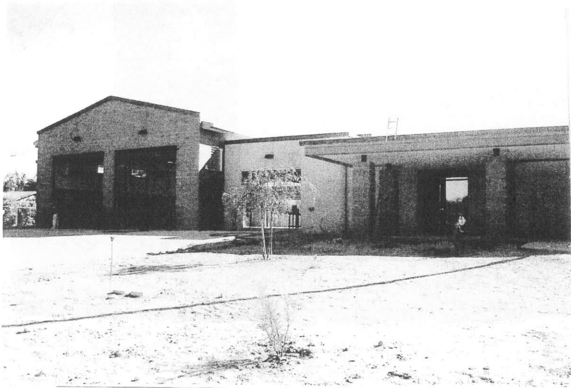
Front View Looking East

If submitting more photographs than will fit on the preceding page, affix the additional photographs below. Identify all photographs with: date taken; "Front View" and "Rear View"; and, if required, "Right Side View" and "Left Side View."