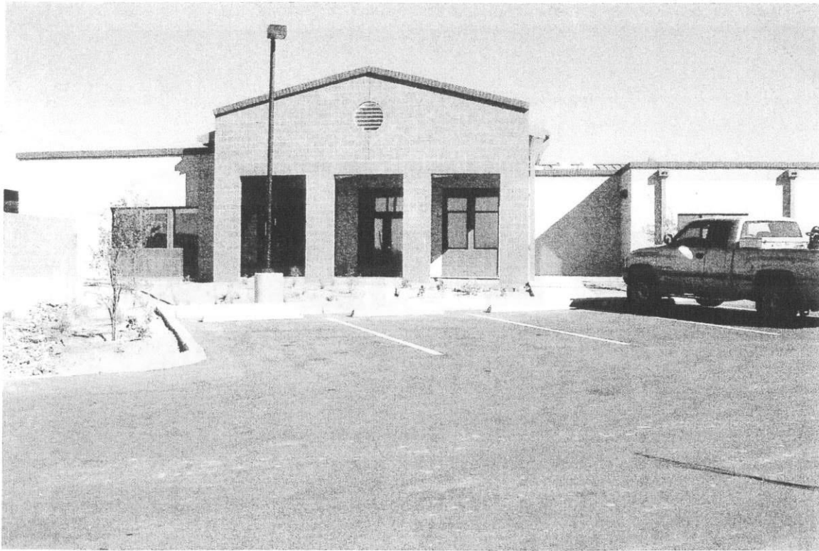
Right Side View Looking North

If submitting more photographs than will fit on the preceding page, affix the additional photographs below. Identify all photographs with: date taken; "Front View" and "Rear View"; and, if required, "Right Side View" and "Left Side View."