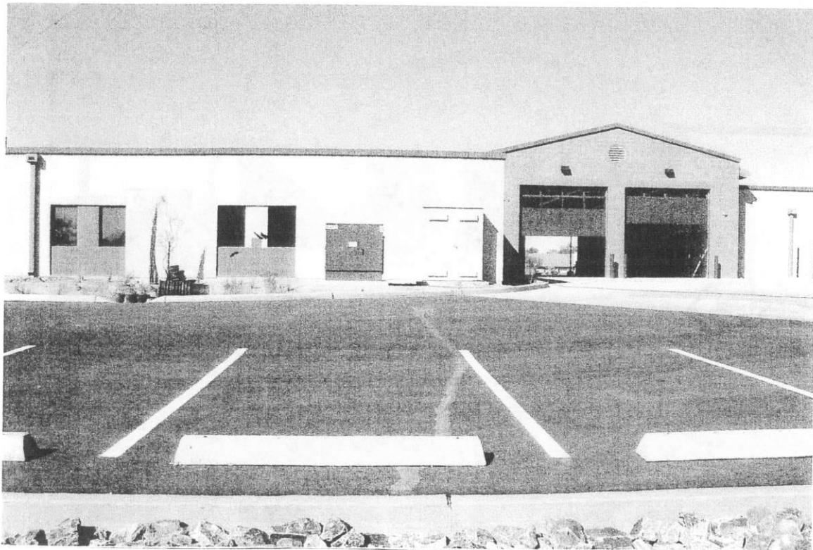
Rear View Looking West

If using the Elevation Certificate to obtain NFIP flood insurance, affix at least Four building photographs below according to the instructions for Item A6. Identify all photographs with: date taken; "Front View" and "Rear View"; and, if required, "Right Side View" and "Left Side View." If submitting more photographs than will fit on this page, use the Continuation Page on the reverse.