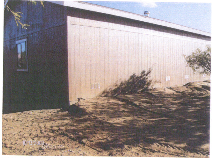
10/13/2009 4280 S KHE SANH GARAGE SW COR