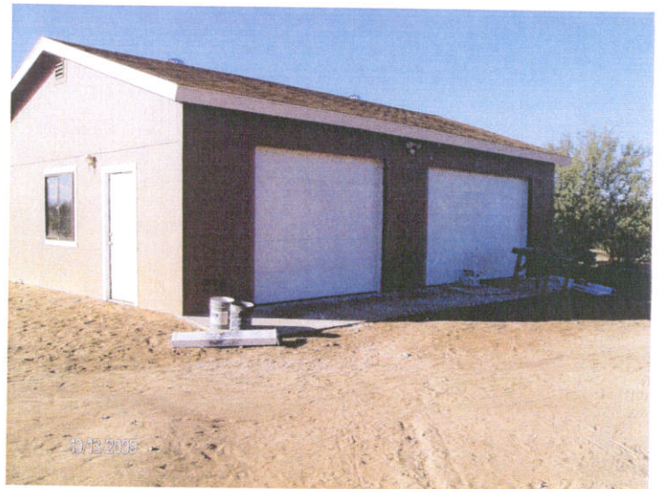
10/13/2009 4280 S KHE SANH GARAGE NE COR