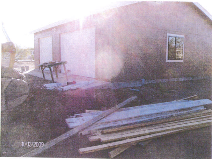
10/13/2009 4280 S KHE SANH GARAGE NW COR