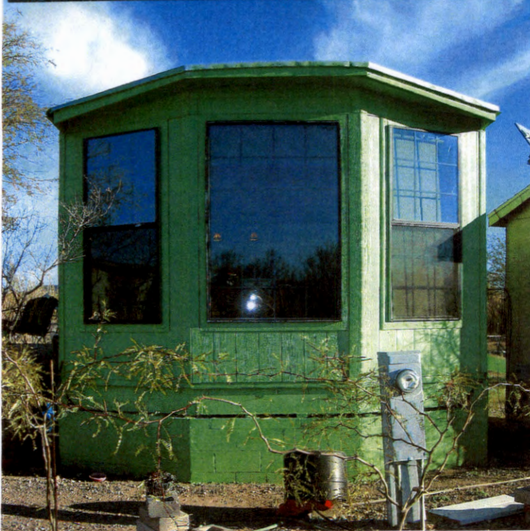
Right Side (Southeast)