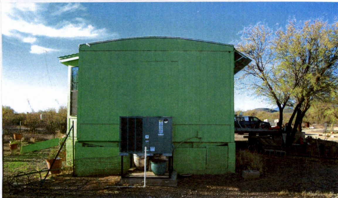
Left side (Northwest)