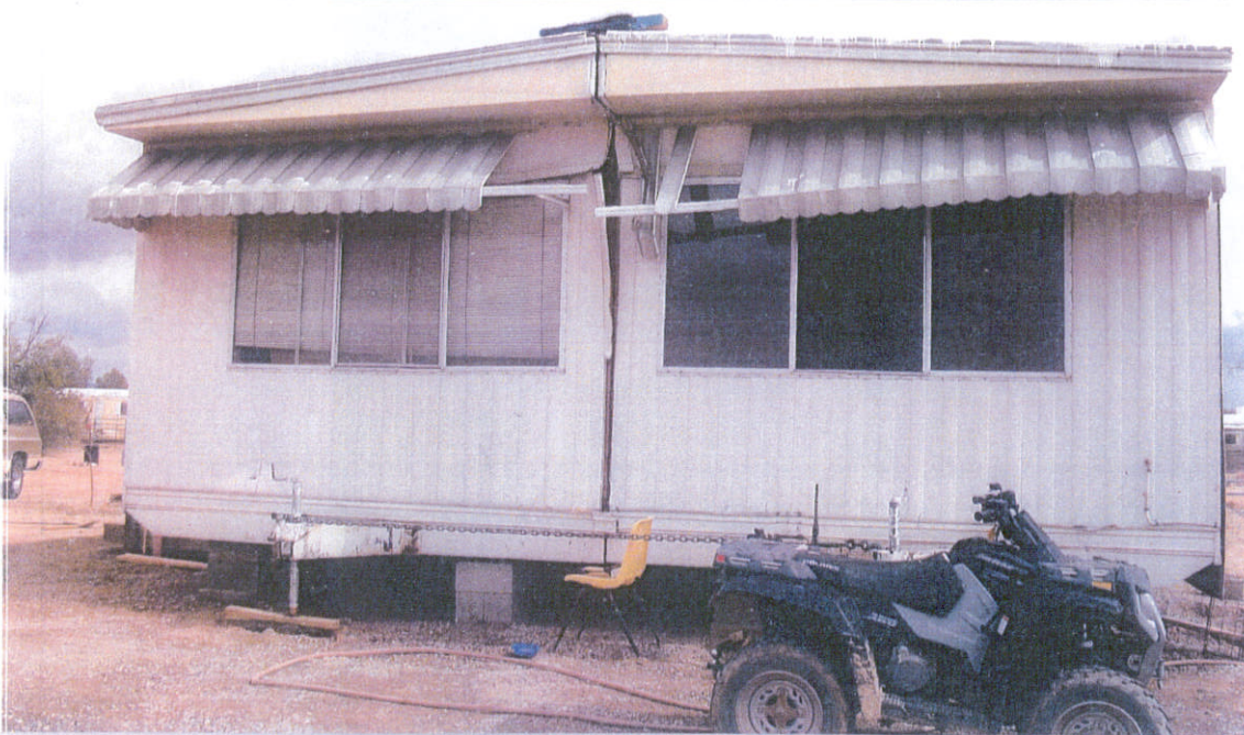
Right side (West)