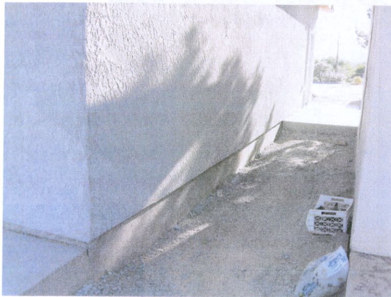
LEFT SIDE (NORTH)