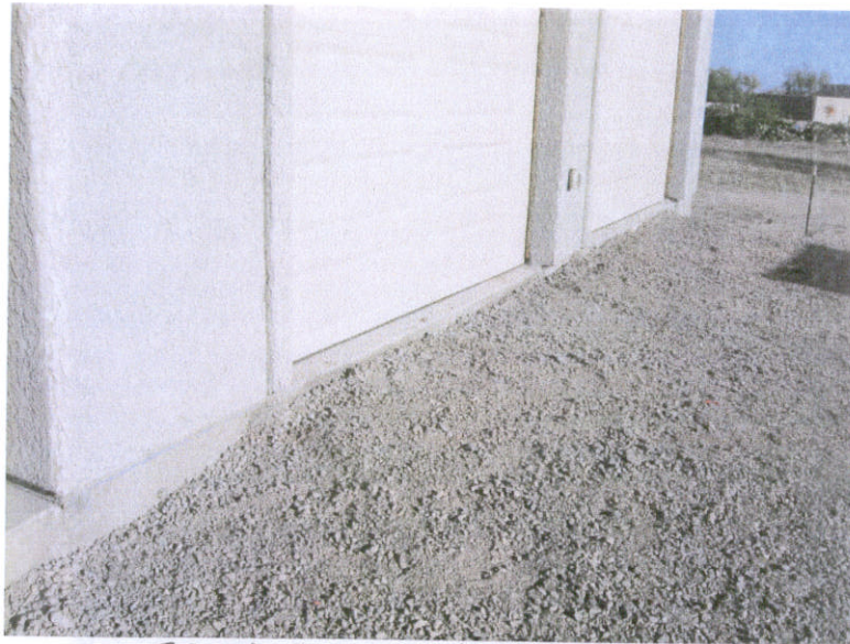
FRONT VIEW (WEST)

If using the Elevation Certificate to obtain NFIP flood insurance, affix at least Four building photographs below according to the instructions for Item A6. Identify all photographs with: date taken; "Front View" and "Rear View"; and, if required, "Right Side View" and "Left Side View." If submitting more photographs than will fit on this page, use the Continuation Page on the reverse.