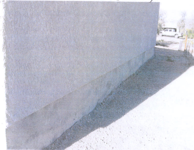
RIGHT SIDE (SOUTH)