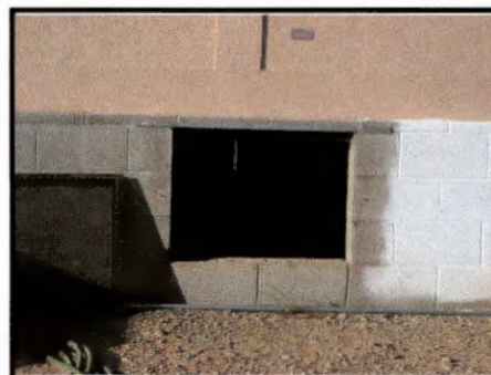
Inspection opening (one of two entries)