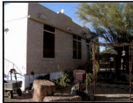
East Face (side)