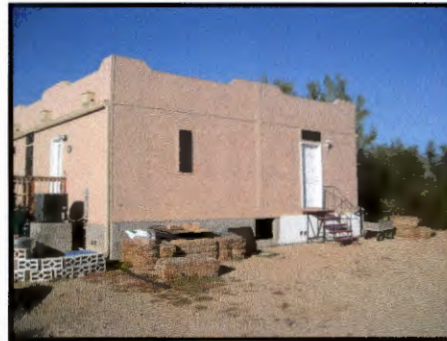
South Face (rear)