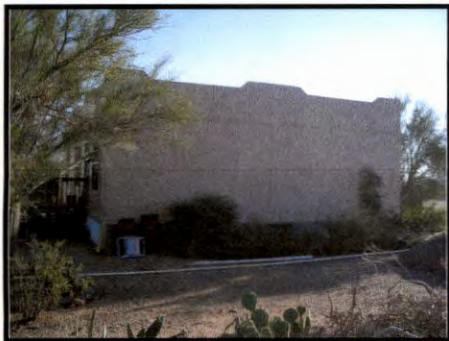
North Face (side)