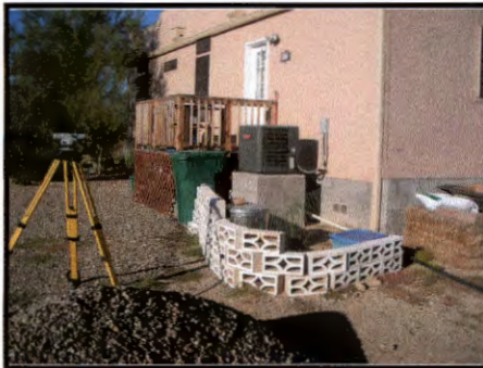
AC Unit adjacent West Face