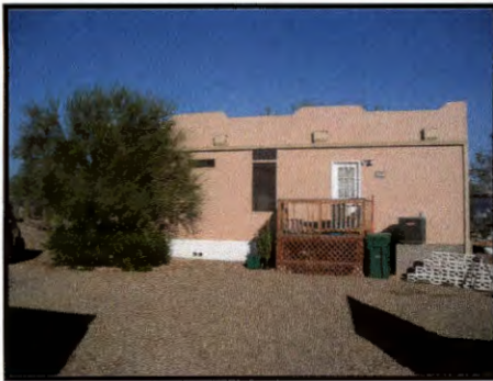
West Face (front)