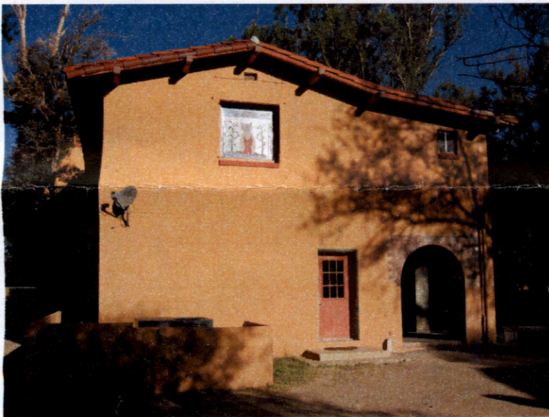
SOUTH SIDE PHOTO 11/05/12