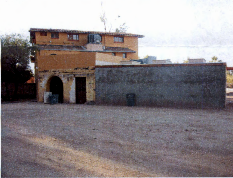
NORTH SIDE PHOTO 11/05/12

If using the Elevation Certificate to obtain NFIP flood insurance, affix at least Four building photographs below according to the instructions for Item A6. Identify all photographs with: date taken; "Front View" and "Rear View"; and, if required, "Right Side View" and "Left Side View." If submitting more photographs than will fit on this page, use the Continuation Page on the reverse.