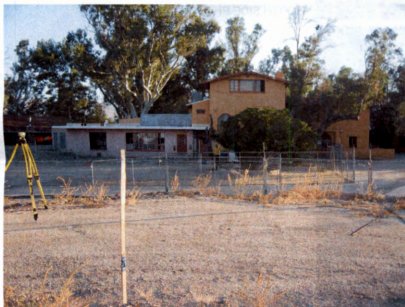
WEST SIDE PHOTO 11/05/12