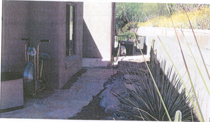
South View, (Left Side), May 5, 2010.