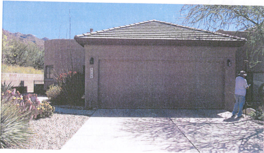
East View, (Front Side), May 5, 2010.