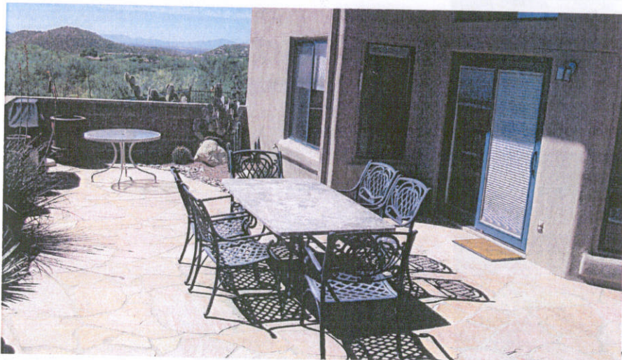
West View, (Rear Side), May 5, 2010.