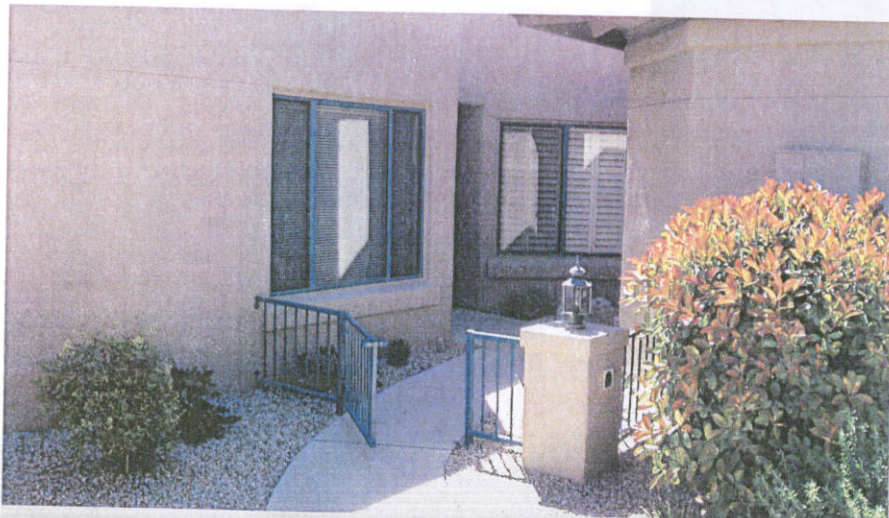
South View, (Left Side), May 5, 2010.