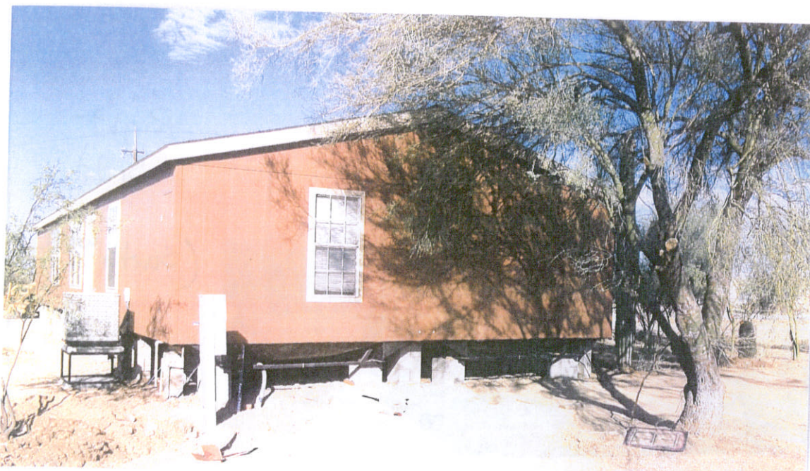
Left side Northeast