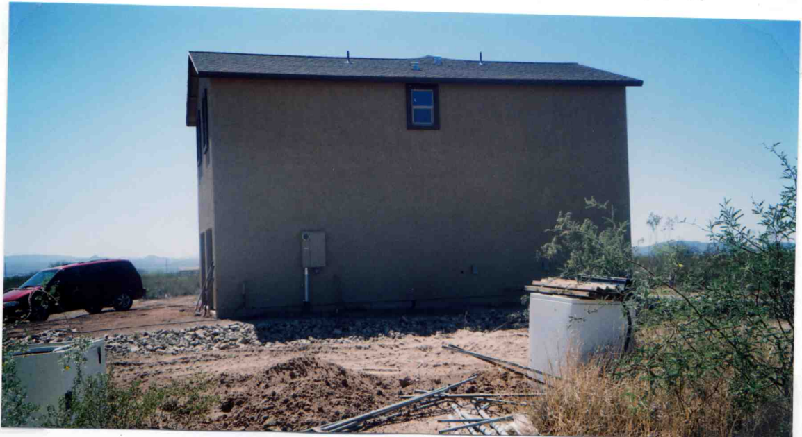
RIGHT SIDE VIEW — EAST — 5-21-11