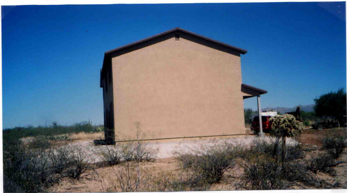
LEFT SIDE VIEW — WEST — 5-21-11