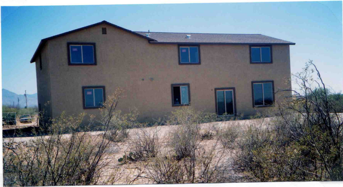
REAR VIEW — NORTH — 5-21-11

If submitting more photographs than will fit on the preceding page, affix the additional photographs below. Identify all photographs with: date taken; "Front View" and "Rear View"; and, if required, "Right Side View" and "Left Side View."