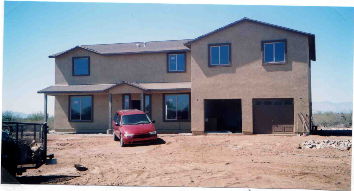
FRONT VIEW — SOUTH — 5-21-11

If using the Elevation Certificate to obtain NFIP flood insurance, affix at least Four building photographs below according to the instructions for Item A6. Identify all photographs with: date taken; "Front View" and "Rear View"; and, if required, "Right Side View" and "Left Side View." If submitting more photographs than will fit on this page, use the Continuation Page on the reverse.