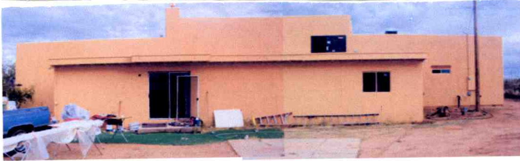
Rear (West) Elevation Looking East