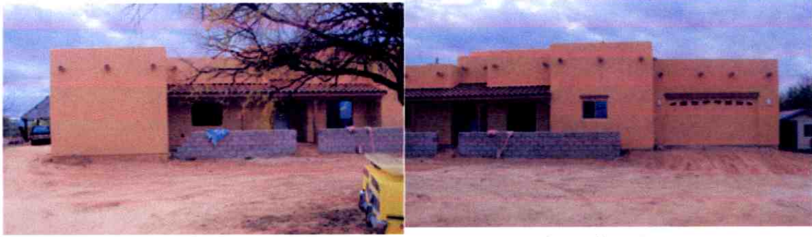
Front (East) Elevation Looking West