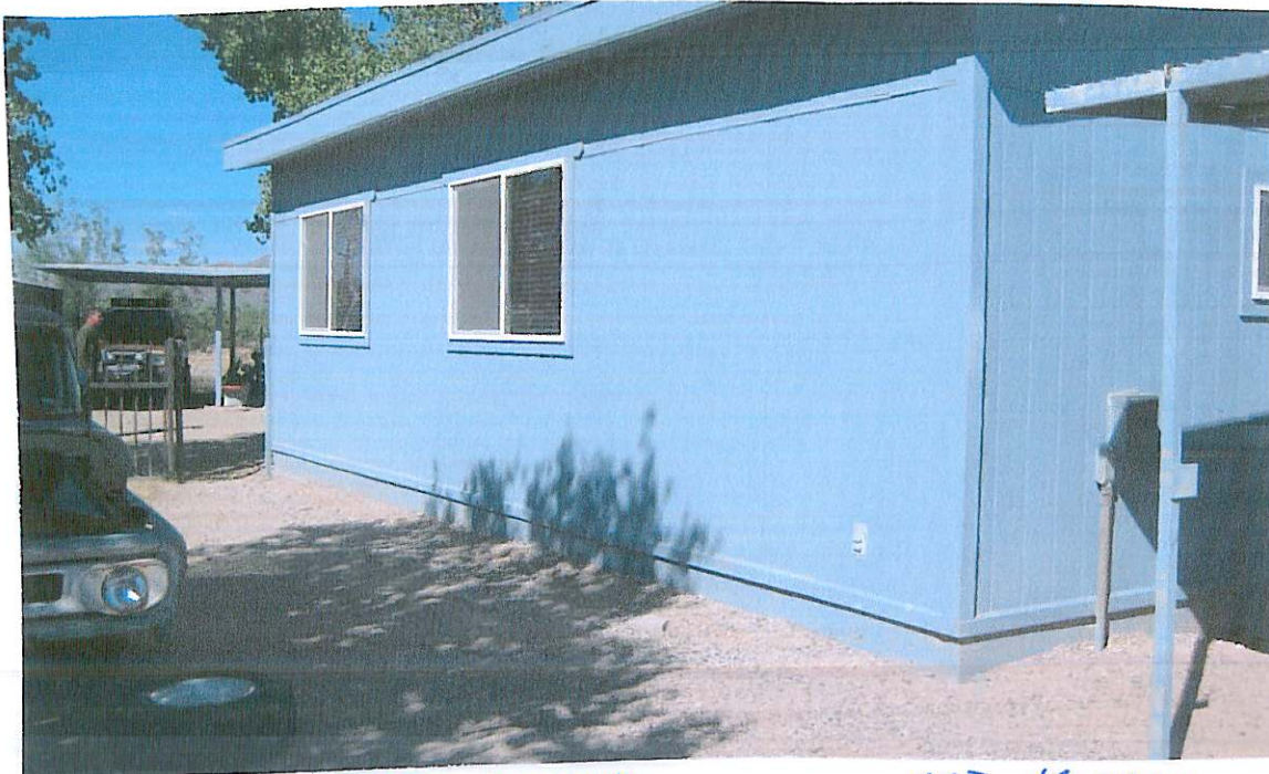
WEST SIDE BUILDING

If submitting more photographs than will fit on the preceding page, affix the additional photographs below. Identify all photographs with: date taken; "Front View" and "Rear View"; and, if required, "Right Side View" and "Left Side View."