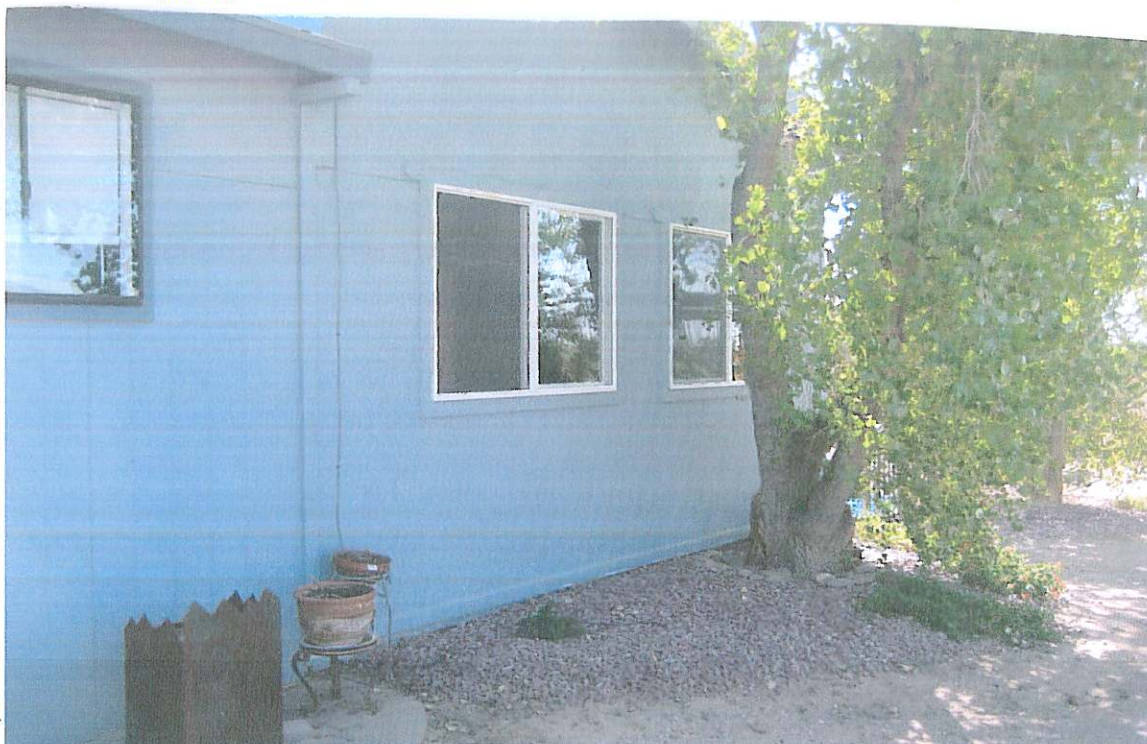
NORTH SIDE BUILDING