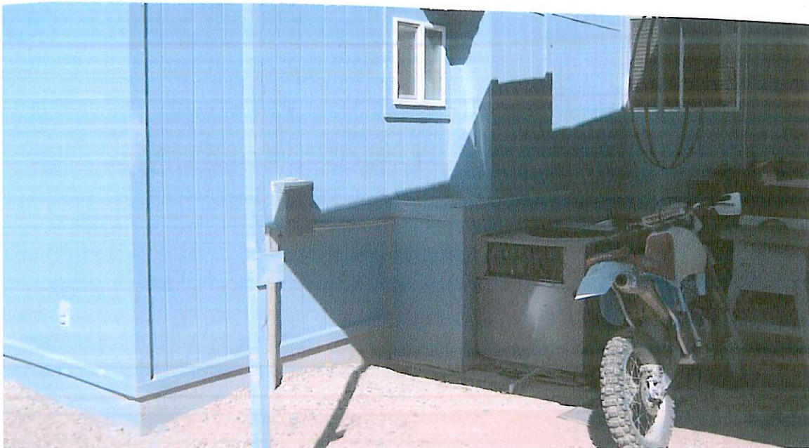
SO. SIDE BUILDING