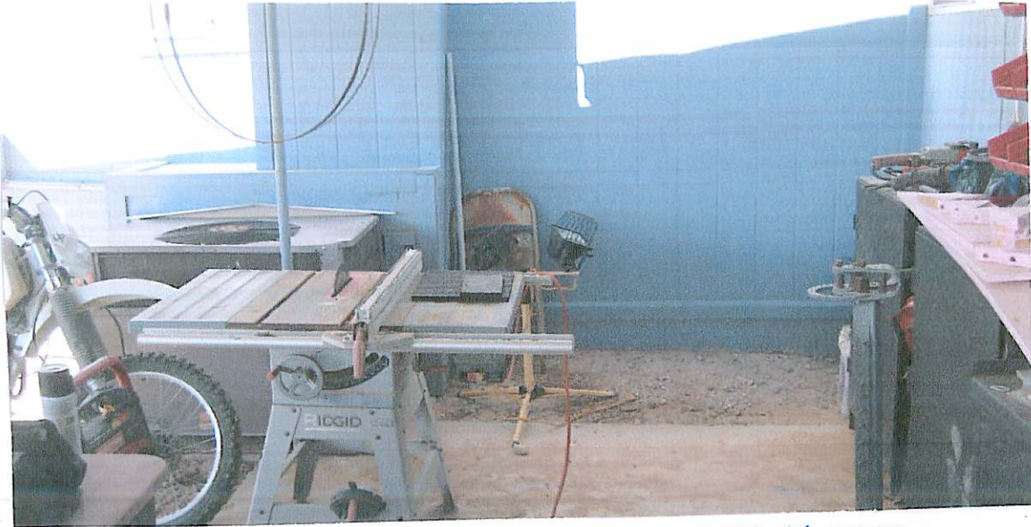
SO. SIDE BUILDING

If using the Elevation Certificate to obtain NFIP flood insurance, affix at least two building photographs below according to the instructions for Item A6. Identify all photographs with: date taken; "Front View" and "Rear View"; and, if required, "Right Side View" and "Left Side View." If submitting more photographs than will fit on this page, use the Continuation Page on the reverse.