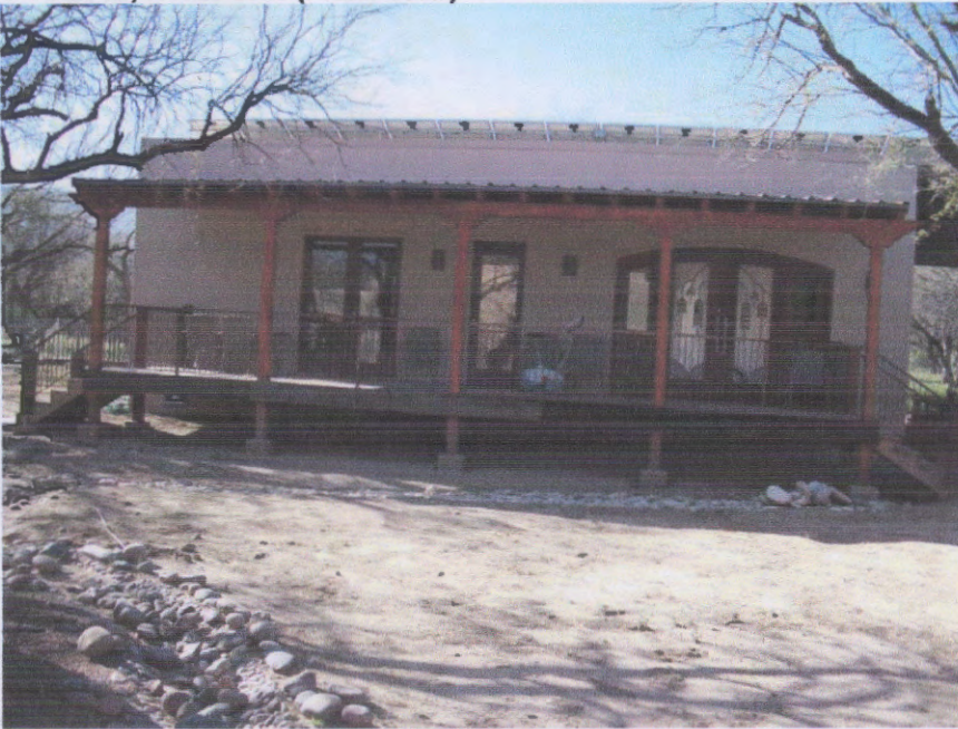
3-15-2012; East Side (Left Side View)