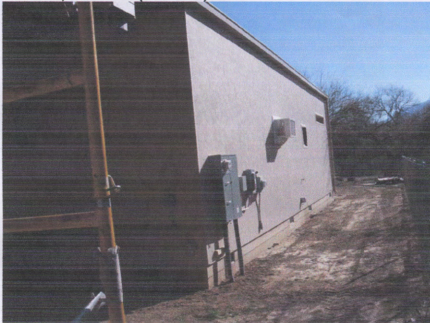
3-15-2012; West Side (Right Side View)