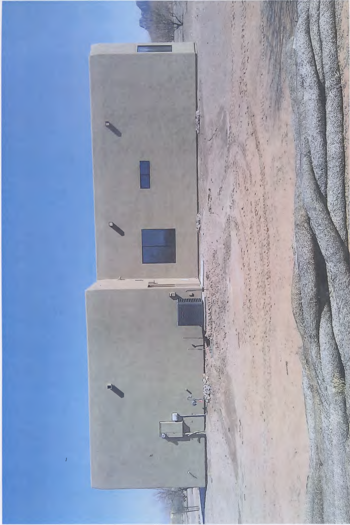
Right Side Looking East