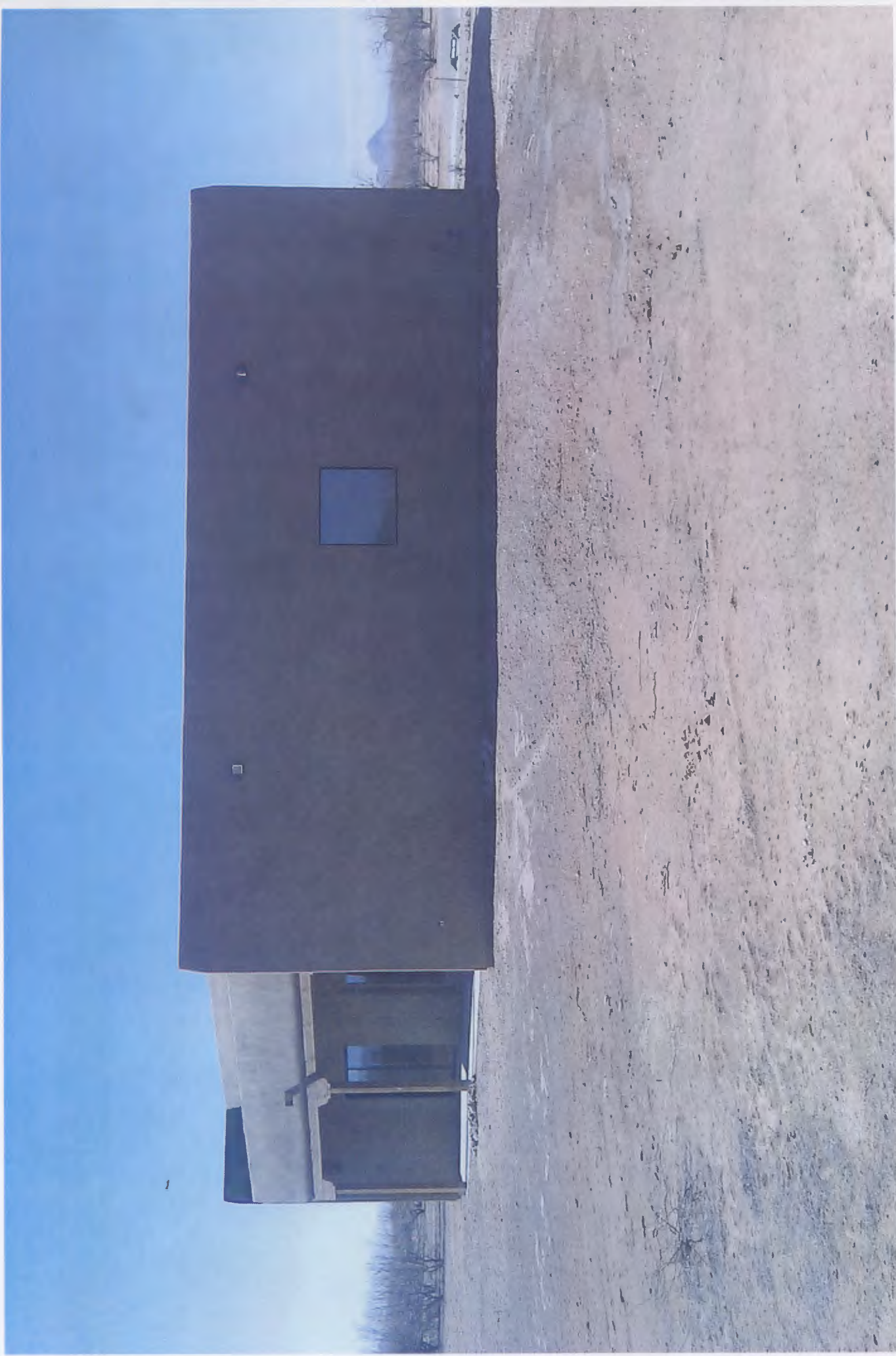
Left side looking West