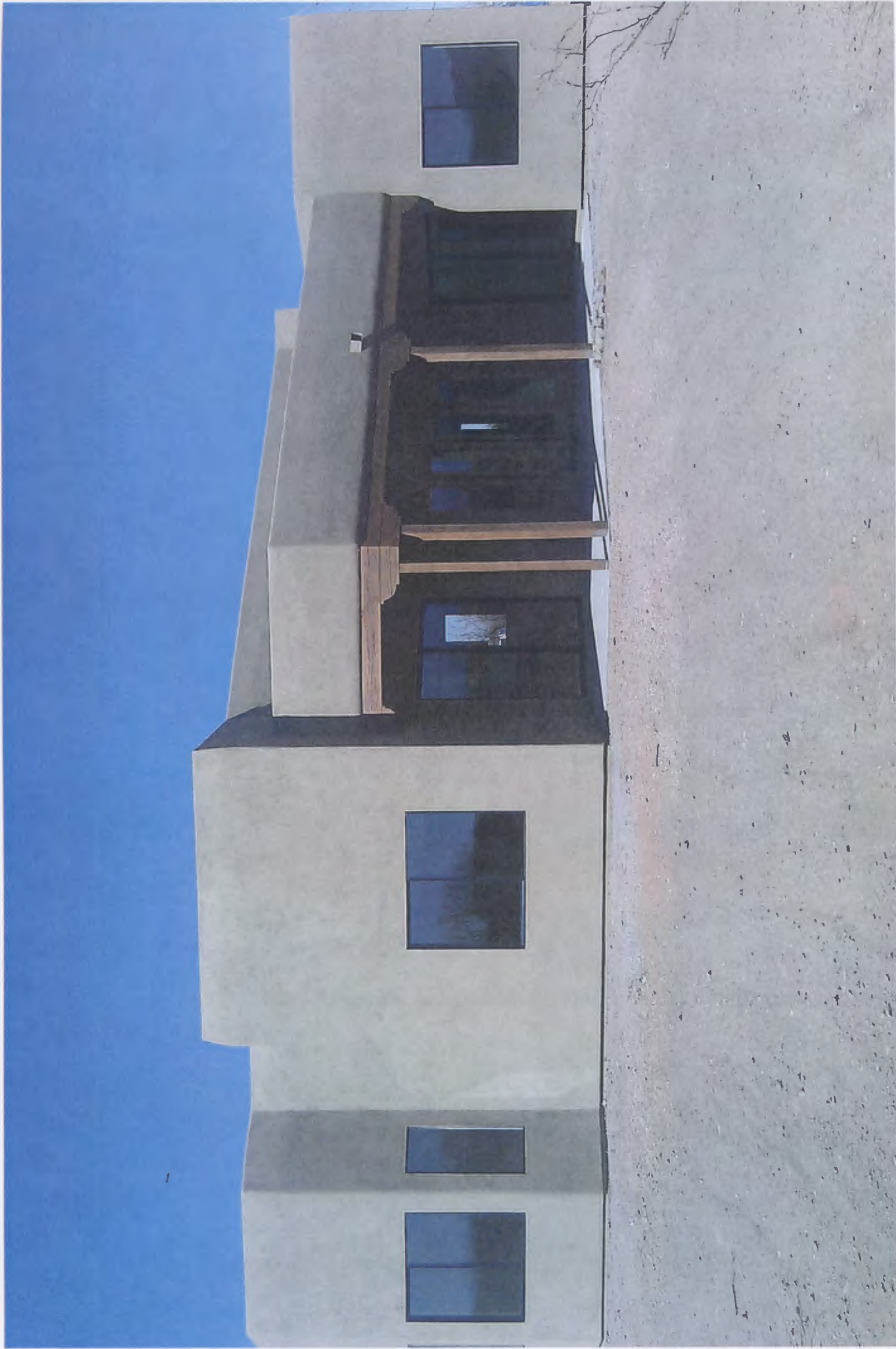
11/11/20 Rear looking North