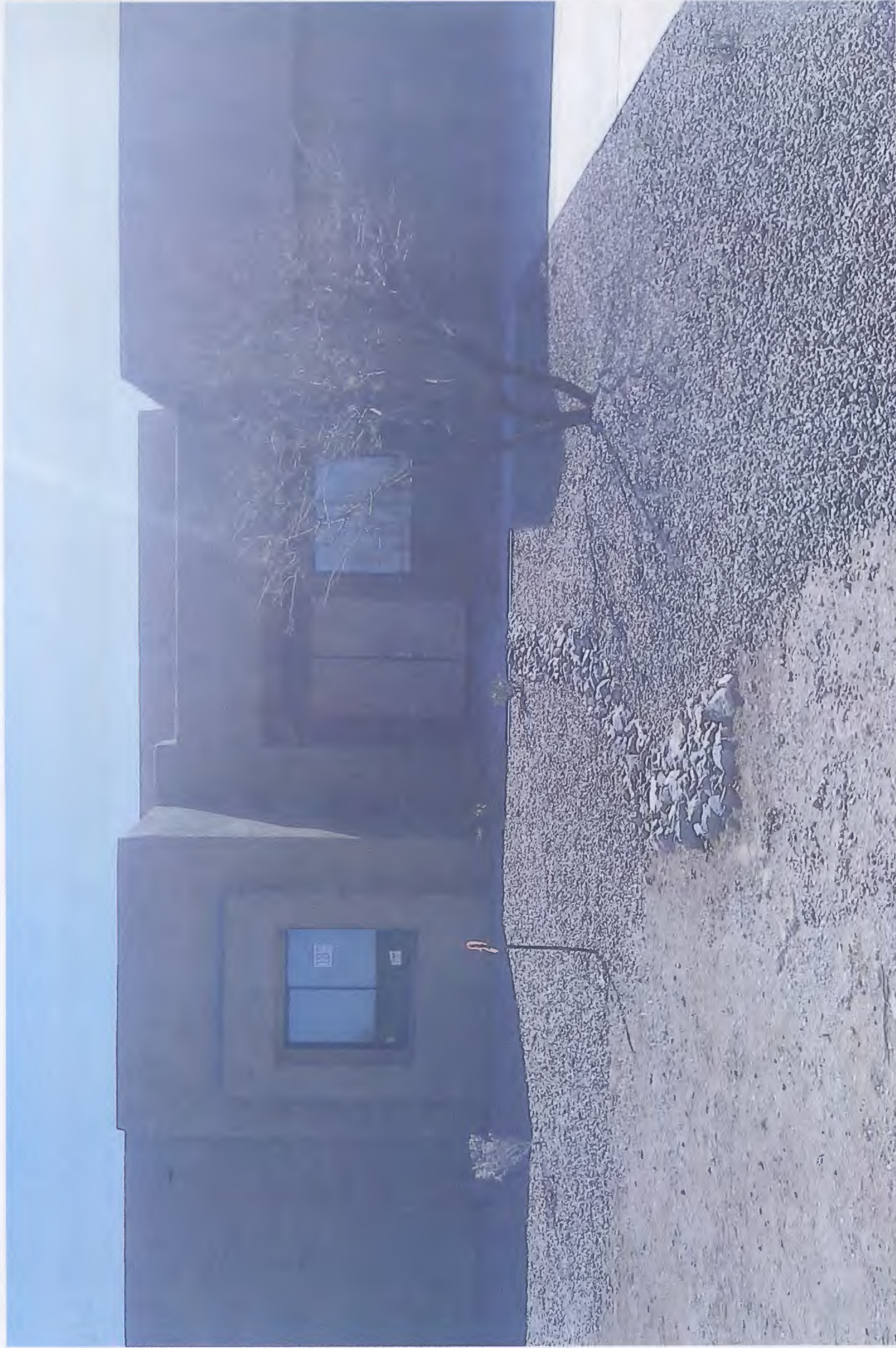
Front Looking South