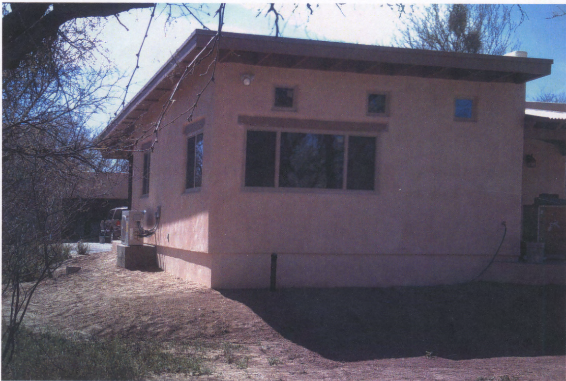
North & East side