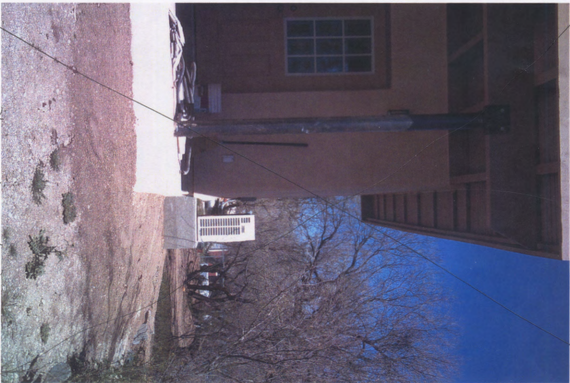
AC UNIT ON EAST SIDE