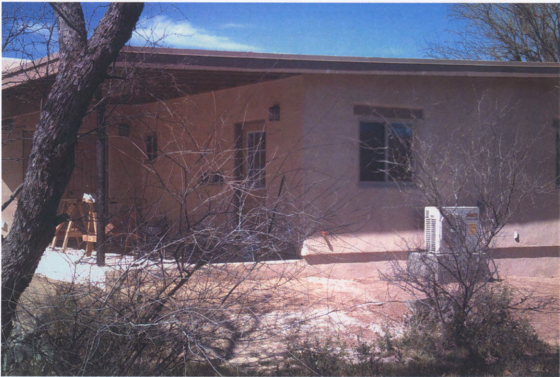
SOUTH EAST SIDE