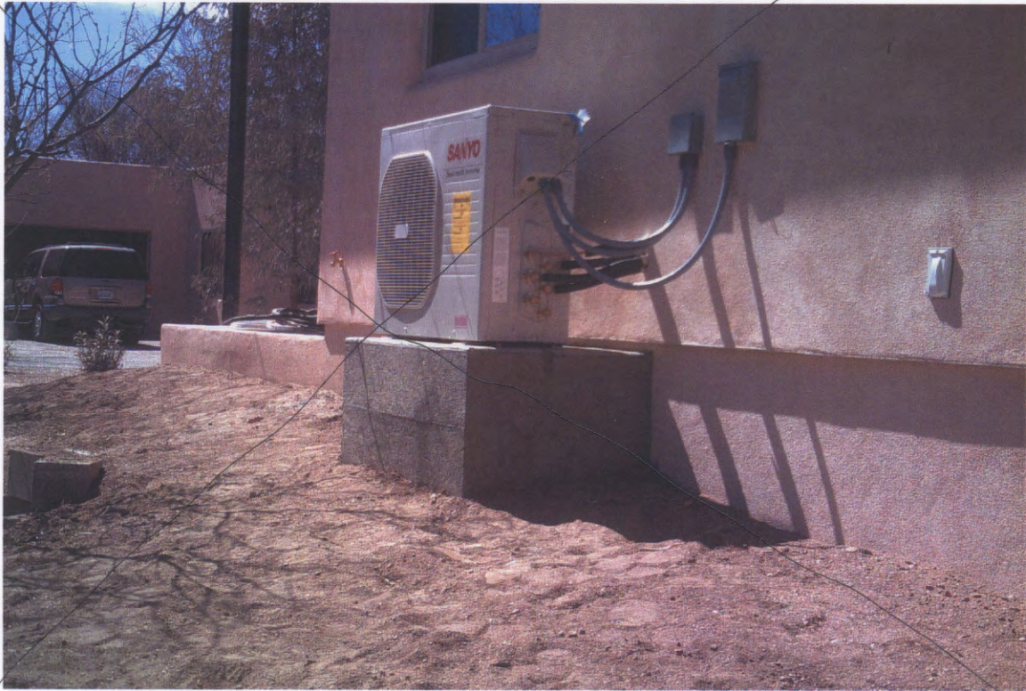
AC Unit ON EAST SIDE