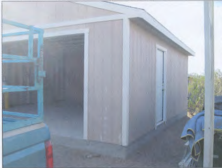
FRONT LOOKING SOUTHEAST PHOTO DATE 2-17-2011

If using the Elevation Certificate to obtain NFIP flood insurance, affix at least Four building photographs below according to the instructions for Item A6. Identify all photographs with: date taken; "Front View" and "Rear View"; and, if required, "Right Side View" and "Left Side View." If submitting more photographs than will fit on this page, use the Continuation Page on the reverse.