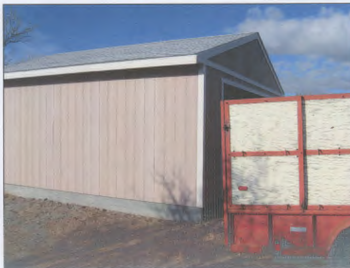
FRONT LOOKING SOUTHWEST PHOTO DATE 2-17-2011