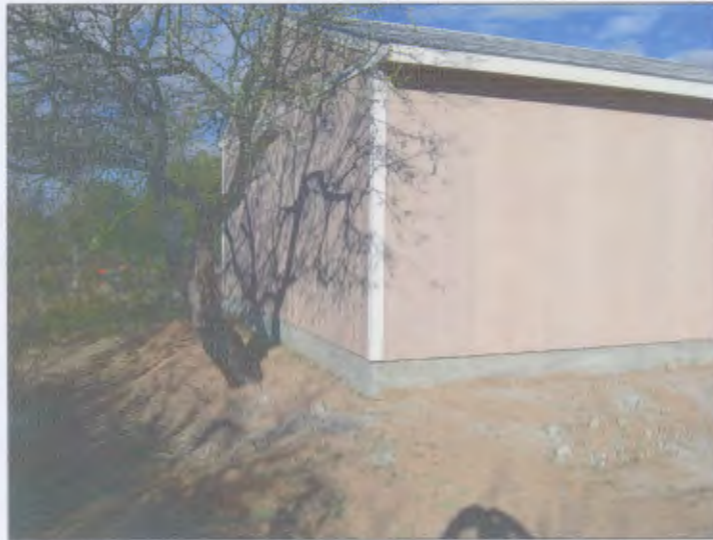
REAR LOOKING NORTHWEST PHOTO DATE 2-17-2011

If submitting more photographs than will fit on the preceding page, affix the additional photographs below. Identify all photographs with: date taken; "Front View" and "Rear View"; and, if required, "Right Side View" and "Left Side View."