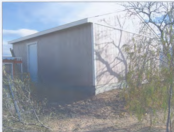
REAR LOOKING NORTHEAST PHOTO DATE 2-17-2011