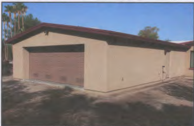
Northeast Corner of Addition Date Photographed: 7/5/11