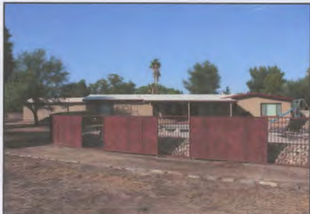
Rear View (north face) Date Photographed: 7/05/11