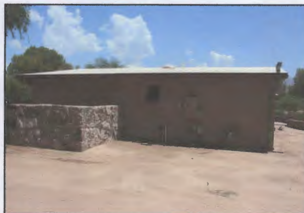
Side View (west face) AC Unit behind wall Photo: 7/05/11