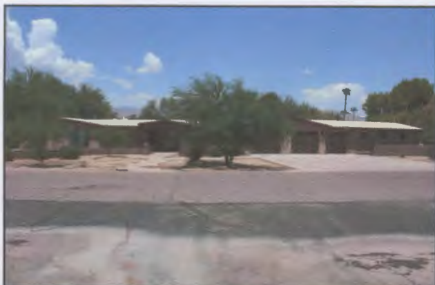
Front View (south face) Date Photographed: 7/05/11

If submitting more photographs than will fit on the preceding page, affix the additional photographs below. Identify all photographs with: date taken; "Front View" and "Rear View"; and, if required, "Right Side View" and "Left Side View."