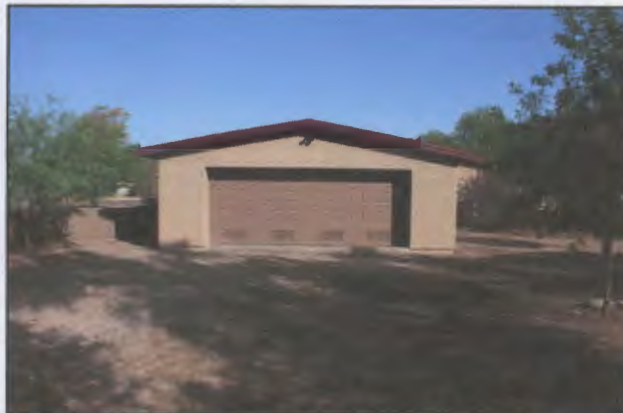
Side View (east face) Date Photographed: 7/05/11