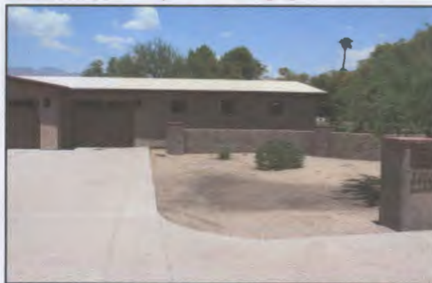
Addition (south face) Date Photographed: 7/05/11