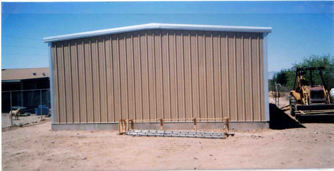
REAR VIEW — SOUTH — 5-1-11

If submitting more photographs than will fit on the preceding page, affix the additional photographs below. Identify all photographs with: date taken; "Front View" and "Rear View"; and, if required, "Right Side View" and "Left Side View."