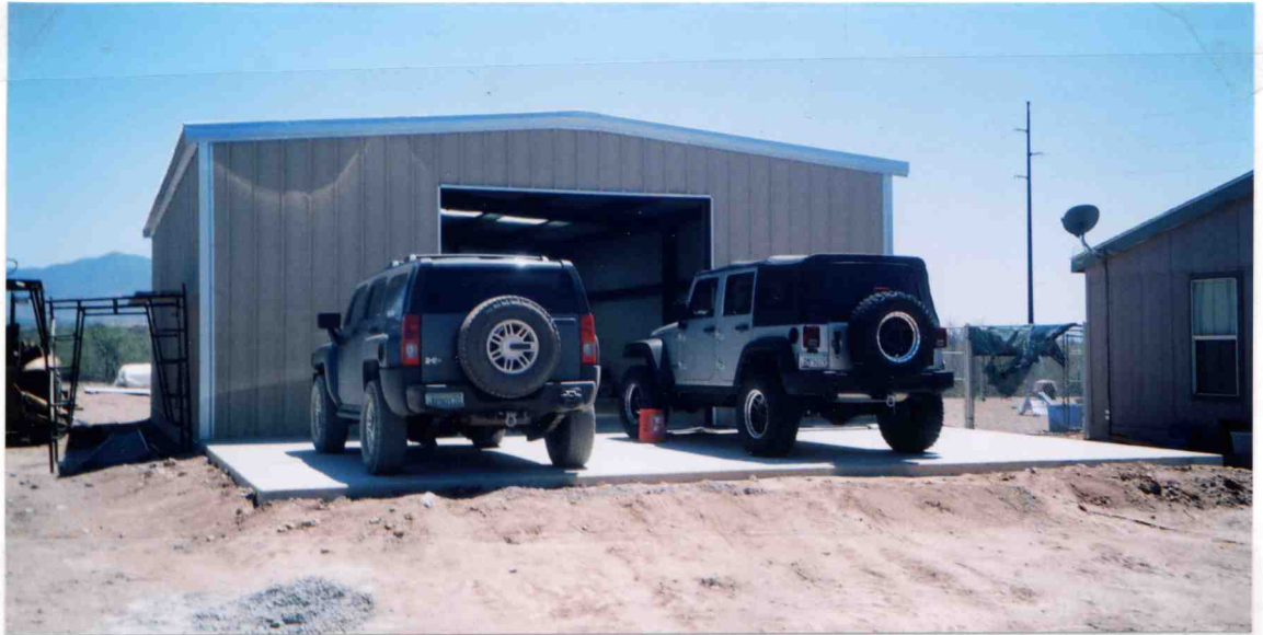
FRONT VIEW — NORTH — 5-1-11

If using the Elevation Certificate to obtain NFIP flood insurance, affix at least Four building photographs below according to the instructions for Item A6. Identify all photographs with: date taken; "Front View" and "Rear View"; and, if required, "Right Side View" and "Left Side View." If submitting more photographs than will fit on this page, use the Continuation Page on the reverse.