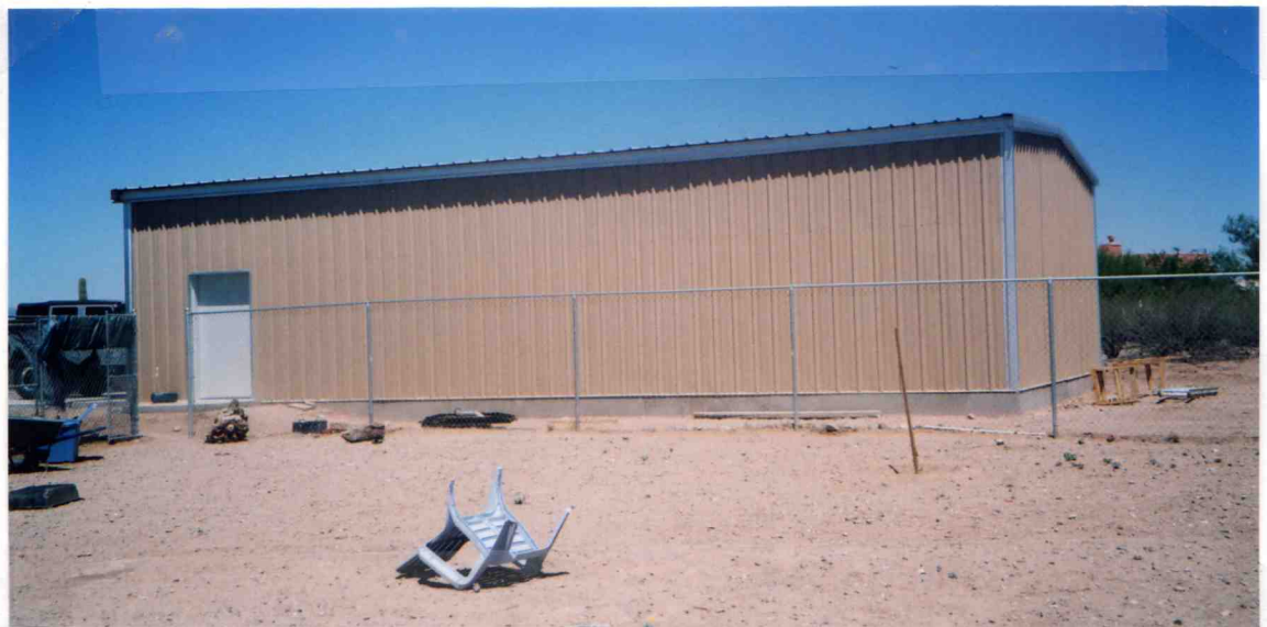
RIGHT SIDE VIEW — WEST — 5-1-11