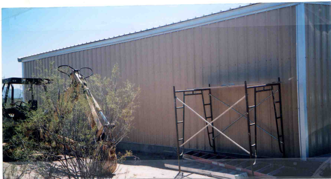
LEFT SIDE VIEW — EAST — 5-1-11