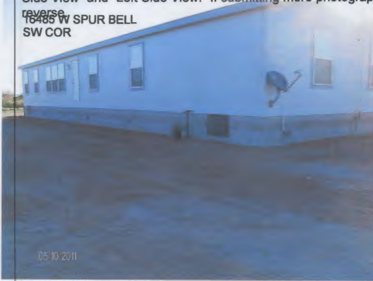
16485 W SPUR BELL SW COR