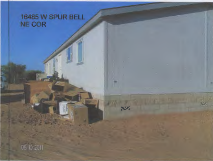
16485 W SPUR BELL NE COR