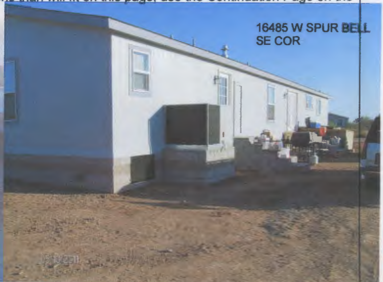
16485 W SPUR BELL SE COR