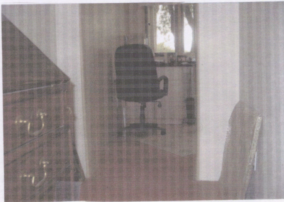
OFFICE – INTERIOR