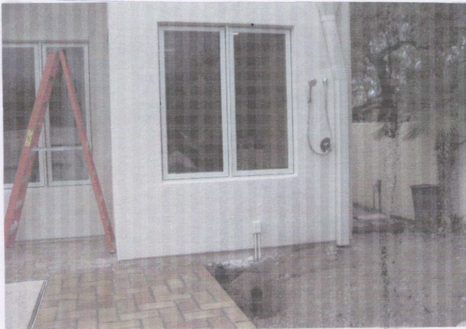
BATHROOM – FRONT