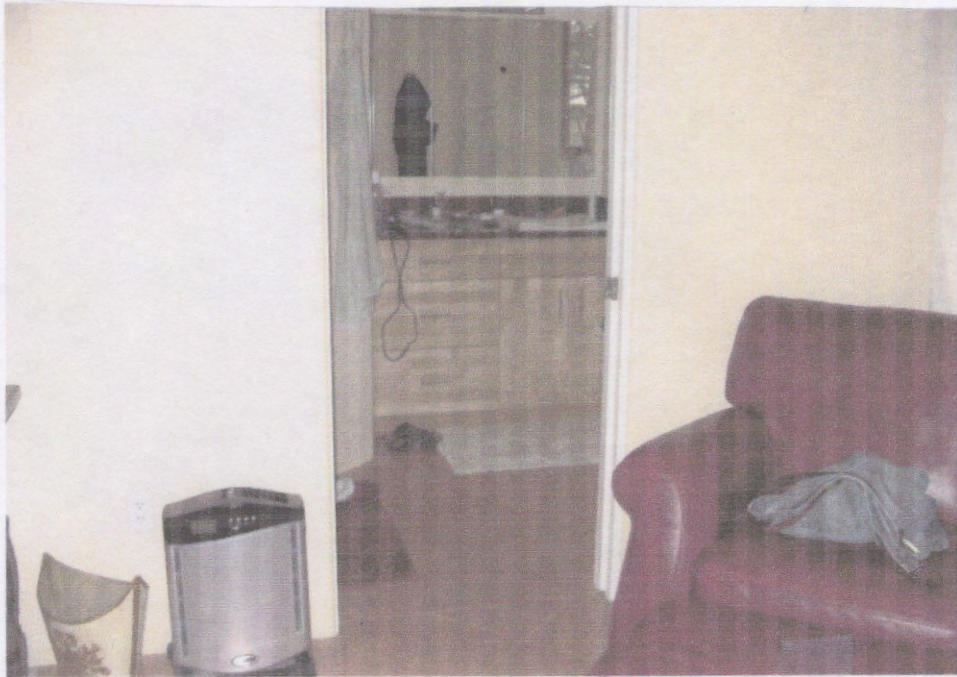
BATHROOM – INTERIOR