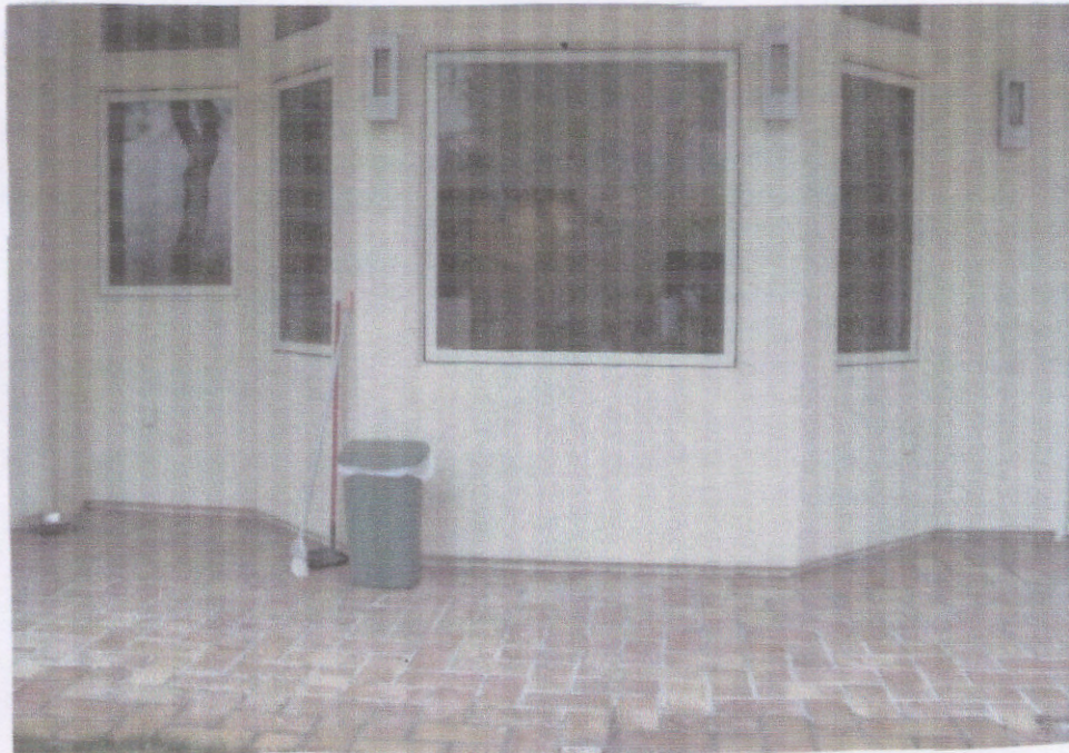
BAY – FRONT