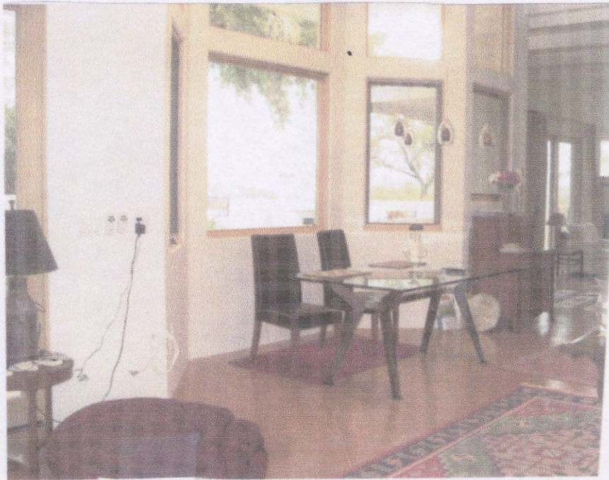
BAY – INTERIOR