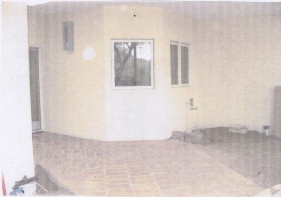
OFFICE – FRONT