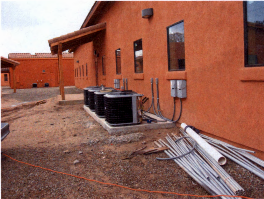
NORTH SIDE PHOTO 12/16/2014

If using the Elevation Certificate to obtain NFIP flood insurance, affix at least 2 building photographs below according to the instructions for Item A6. Identify all photographs with date taken; "Front View" and "Rear View"; and, if required, "Right Side View" and "Left Side View." When applicable, photographs must show the foundation with representative examples of the flood openings or vents, as indicated in Section A8. If submitting more photographs than will fit on this page, use the Continuation Page.