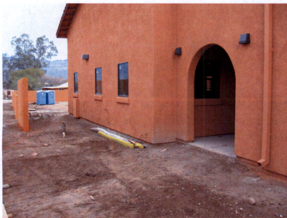
WEST SIDE PHOTO 12/16/2014