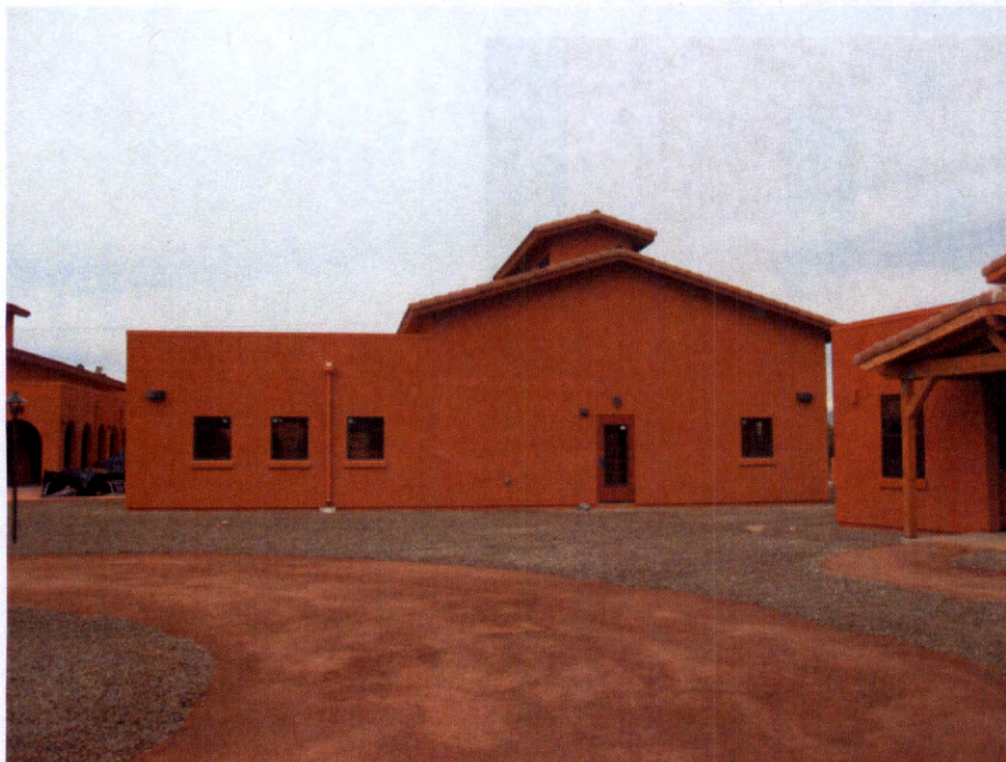
EAST SIDE PHOTO 12/16/2014

If submitting more photographs than will fit on the preceding page, affix the additional photographs below. Identify all photographs with: date taken; "Front View" and "Rear View"; and, if required, "Right Side View" and "Left Side View." When applicable, photographs must show the foundation with representative examples of the flood openings or vents, as indicated in Section A8.