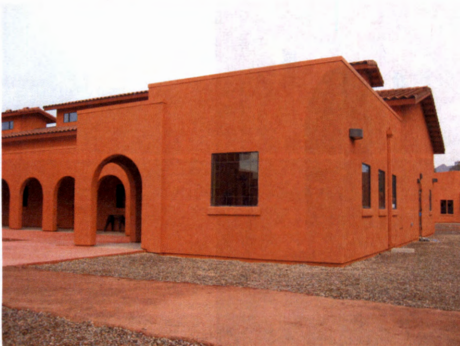
SOUTH SIDE PHOTO 12/16/2014