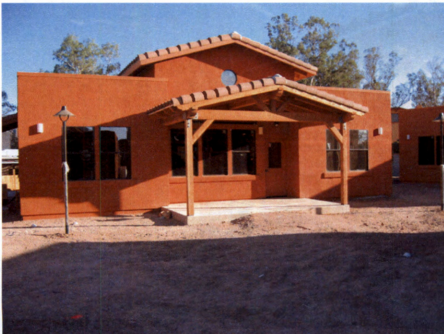
SOUTH SIDE PHOTO 11/18/2014