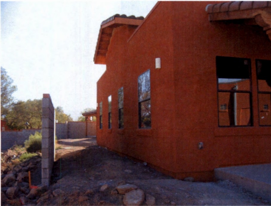
NORTH SIDE PHOTO 11/18/2014

If using the Elevation Certificate to obtain NFIP flood insurance, affix at least 2 building photographs below according to the instructions for Item A6. Identify all photographs with date taken; "Front View" and "Rear View"; and, if required, "Right Side View" and "Left Side View." When applicable, photographs must show the foundation with representative examples of the flood openings or vents, as indicated in Section A8. If submitting more photographs than will fit on this page, use the Continuation Page.