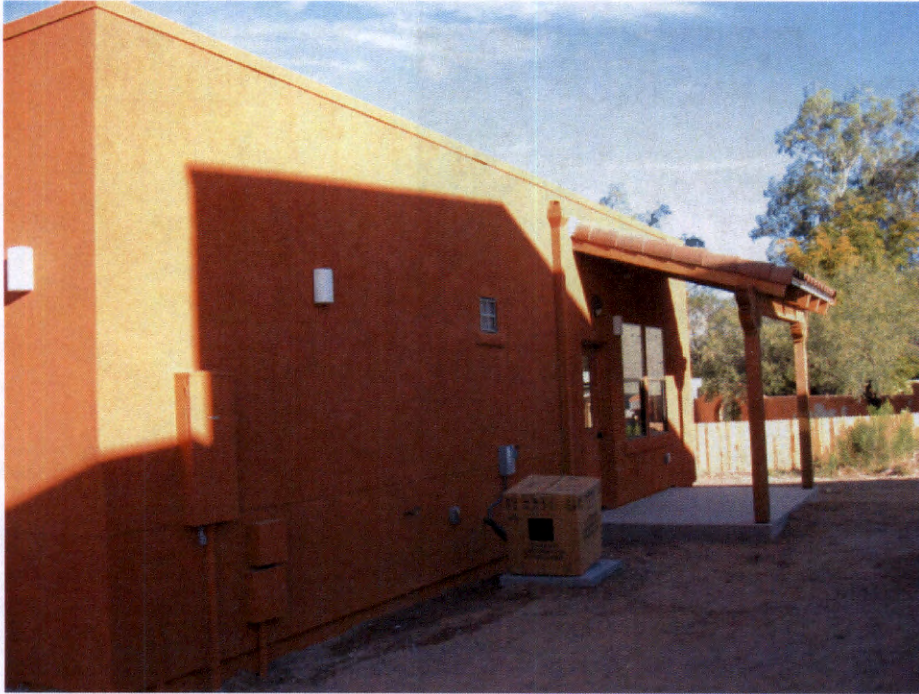
EAST SIDE PHOTO 11/18/2014

If submitting more photographs than will fit on the preceding page, affix the additional photographs below. Identify all photographs with: date taken; "Front View" and "Rear View"; and, if required, "Right Side View" and "Left Side View." When applicable, photographs must show the foundation with representative examples of the flood openings or vents, as indicated in Section A8.