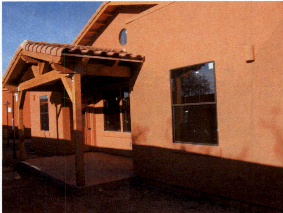
SOUTH SIDE PHOTO 11/18/2014