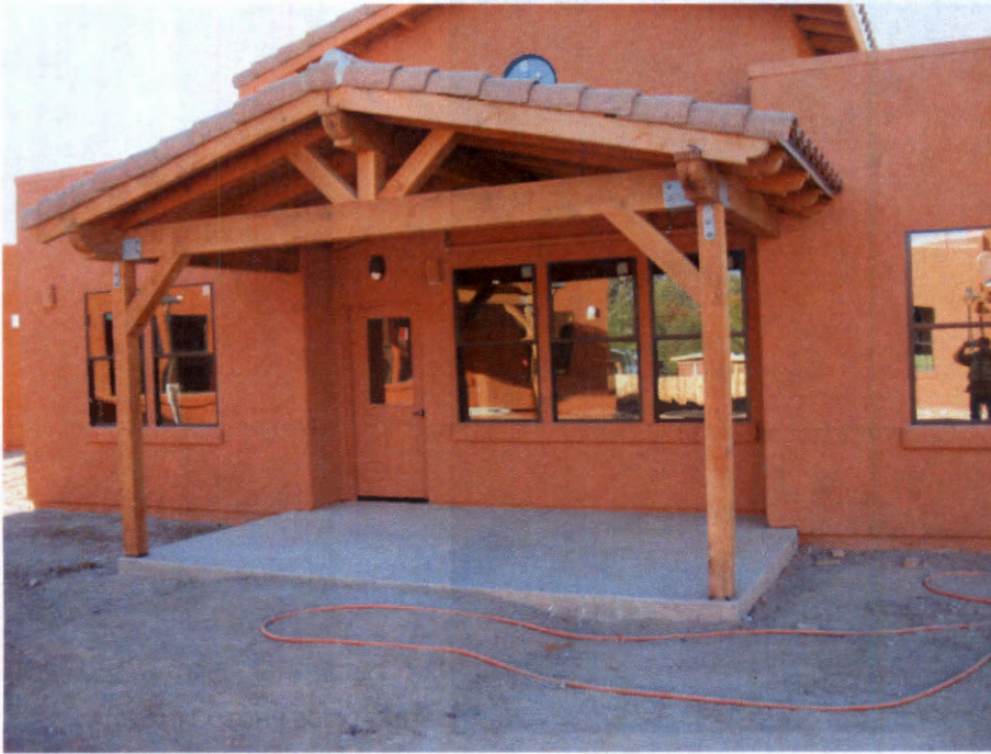
NORTH SIDE PHOTO 11/18/2014

If using the Elevation Certificate to obtain NFIP flood insurance, affix at least 2 building photographs below according to the instructions for Item A6. Identify all photographs with date taken; "Front View" and "Rear View"; and, if required, "Right Side View" and "Left Side View." When applicable, photographs must show the foundation with representative examples of the flood openings or vents, as indicated in Section A8. If submitting more photographs than will fit on this page, use the Continuation Page.