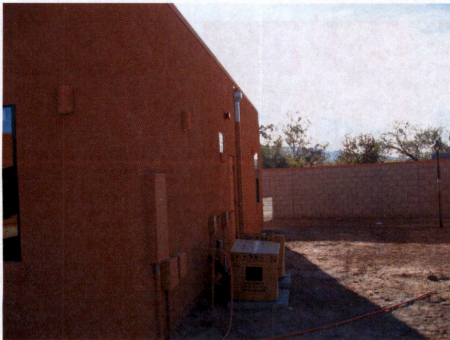
WEST SIDE PHOTO 11/18/2014