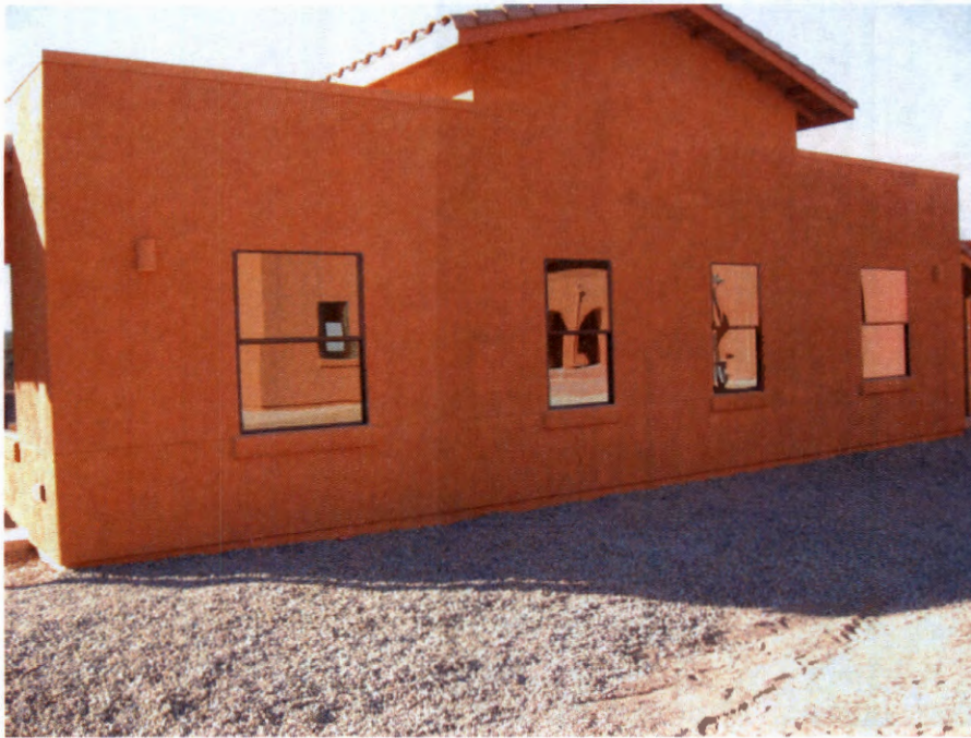
NORTH SIDE PHOTO 11/18/2014

If using the Elevation Certificate to obtain NFIP flood insurance, affix at least 2 building photographs below according to the instructions for Item A6. Identify all photographs with date taken; "Front View" and "Rear View"; and, if required, "Right Side View" and "Left Side View." When applicable, photographs must show the foundation with representative examples of the flood openings or vents, as indicated in Section A8. If submitting more photographs than will fit on this page, use the Continuation Page.