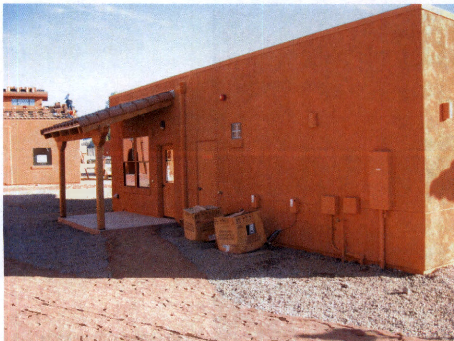
WEST SIDE PHOTO 11/18/2014