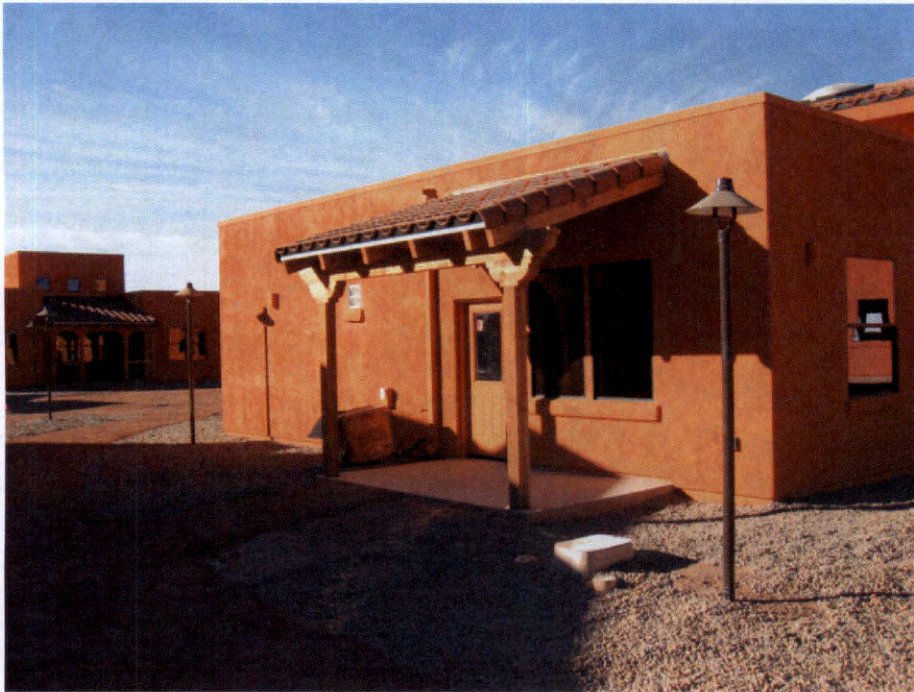
EAST SIDE PHOTO 11/18/2014

If submitting more photographs than will fit on the preceding page, affix the additional photographs below. Identify all photographs with: date taken; "Front View" and "Rear View"; and, if required, "Right Side View" and "Left Side View." When applicable, photographs must show the foundation with representative examples of the flood openings or vents, as indicated in Section A8.