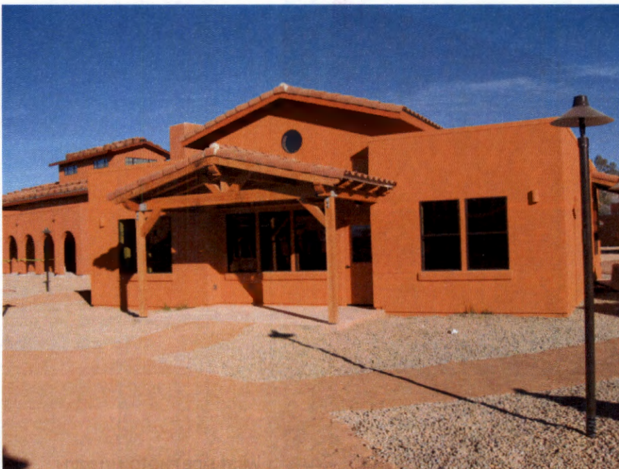
SOUTH SIDE PHOTO 11/18/2014