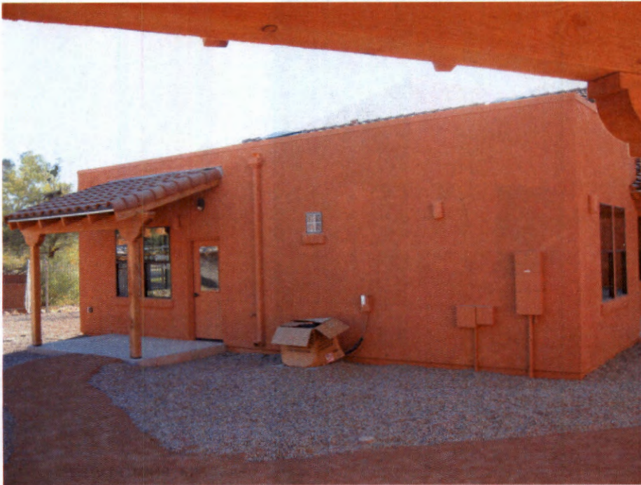
NORTH SIDE PHOTO 11/18/2014

If using the Elevation Certificate to obtain NFIP flood insurance, affix at least 2 building photographs below according to the instructions for Item A6. Identify all photographs with date taken; "Front View" and "Rear View"; and, if required, "Right Side View" and "Left Side View." When applicable, photographs must show the foundation with representative examples of the flood openings or vents, as indicated in Section A8. If submitting more photographs than will fit on this page, use the Continuation Page.