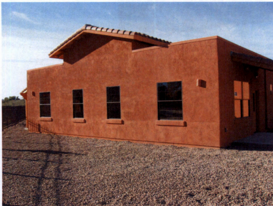
EAST SIDE PHOTO 11/18/2014

If submitting more photographs than will fit on the preceding page, affix the additional photographs below. Identify all photographs with: date taken; "Front View" and "Rear View"; and, if required, "Right Side View" and "Left Side View." When applicable, photographs must show the foundation with representative examples of the flood openings or vents, as indicated in Section A8.