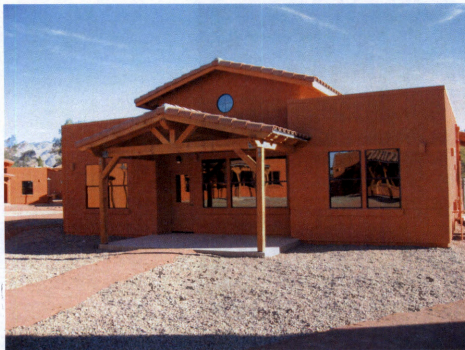
WEST SIDE PHOTO 11/18/2014