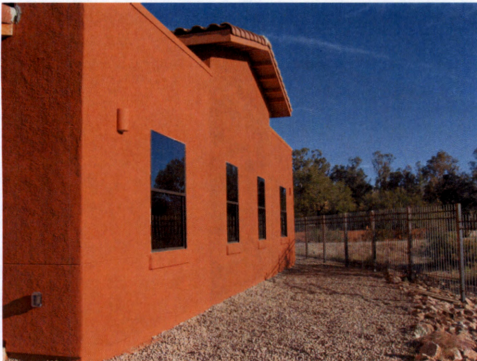
EAST SIDE PHOTO 11/18/2014

If submitting more photographs than will fit on the preceding page, affix the additional photographs below. Identify all photographs with: date taken; "Front View" and "Rear View"; and, if required, "Right Side View" and "Left Side View." When applicable, photographs must show the foundation with representative examples of the flood openings or vents, as indicated in Section A8.