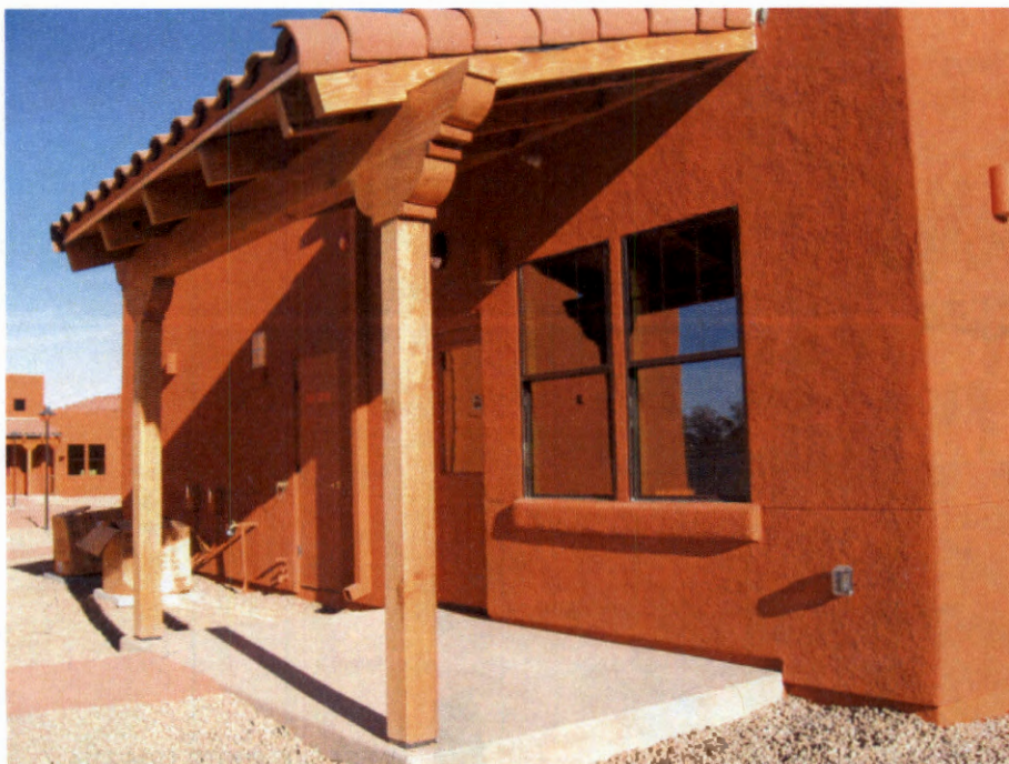
SOUTH SIDE PHOTO 11/18/2014