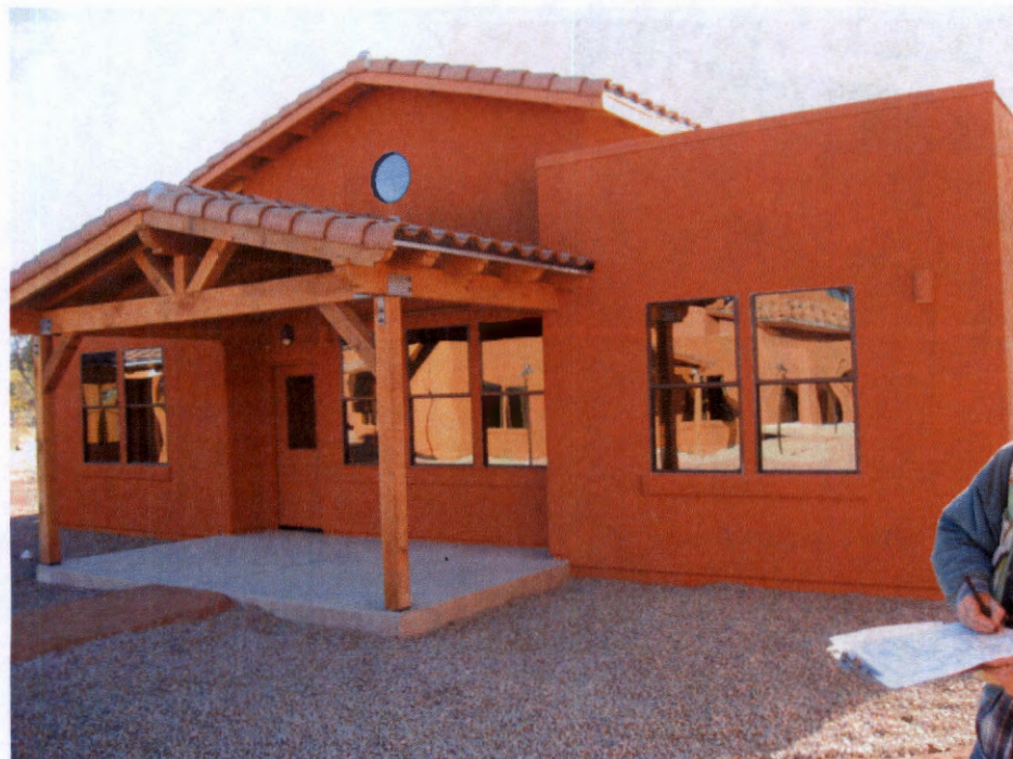
WEST SIDE PHOTO 11/18/2014