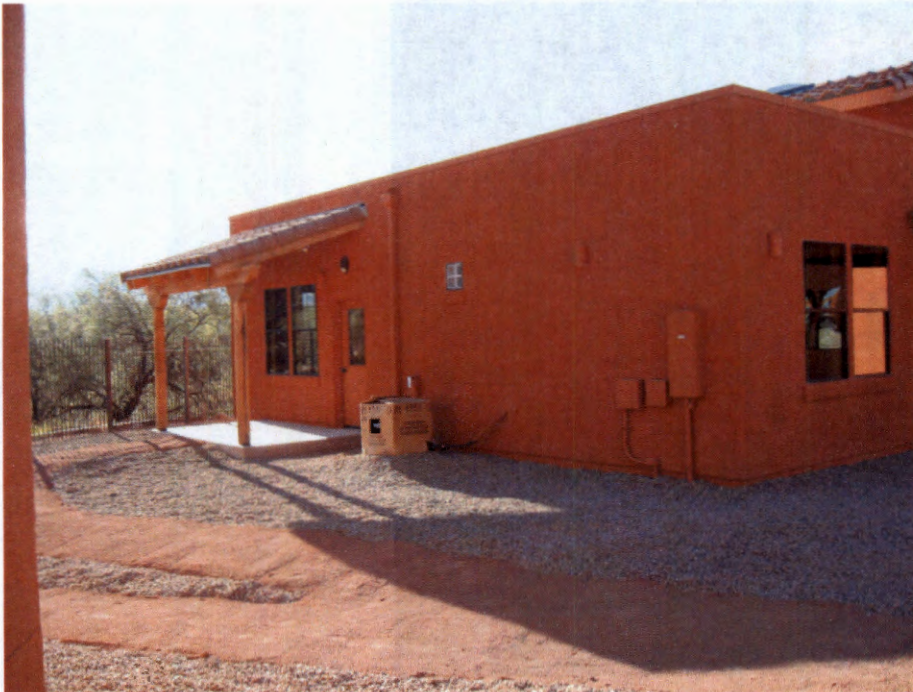
NORTH SIDE PHOTO 11/18/2014

If using the Elevation Certificate to obtain NFIP flood insurance, affix at least 2 building photographs below according to the instructions for Item A6. Identify all photographs with date taken; "Front View" and "Rear View"; and, if required, "Right Side View" and "Left Side View." When applicable, photographs must show the foundation with representative examples of the flood openings or vents, as indicated in Section A8. If submitting more photographs than will fit on this page, use the Continuation Page.