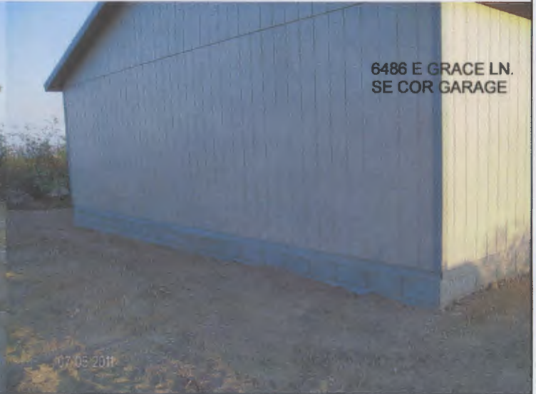
6486 E GRACE LN. SE COR GARAGE