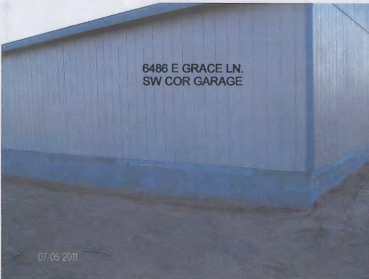
6486 E GRACE LN. SW COR GARAGE