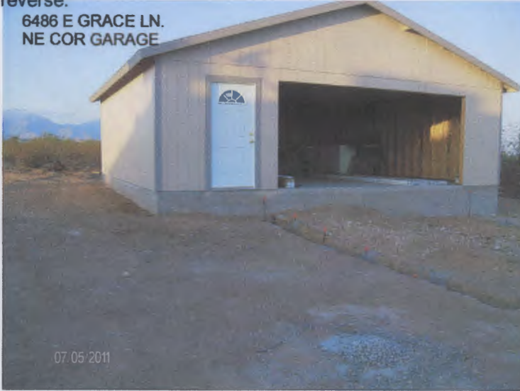
6486 E GRACE LN. NE COR GARAGE