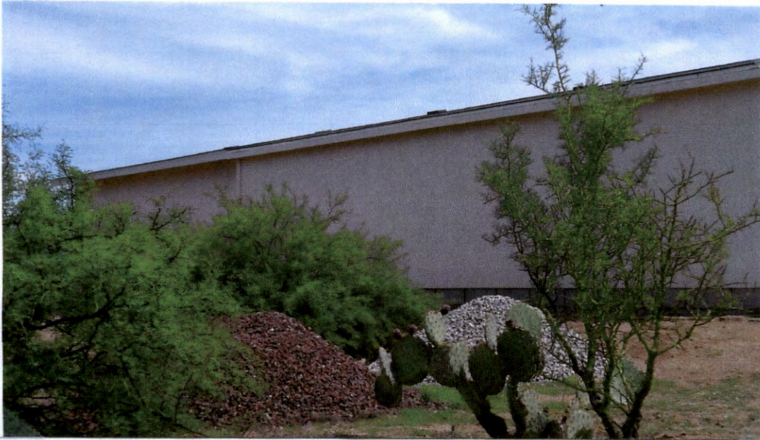
REAR VIEW — WEST — 7-28-14

If submitting more photographs than will fit on the preceding page, affix the additional photographs below. Identify all photographs with: date taken; "Front View" and "Rear View"; and, if required, "Right Side View" and "Left Side View." When applicable, photographs must show the foundation with representative examples of the flood openings or vents, as indicated in Section A8.