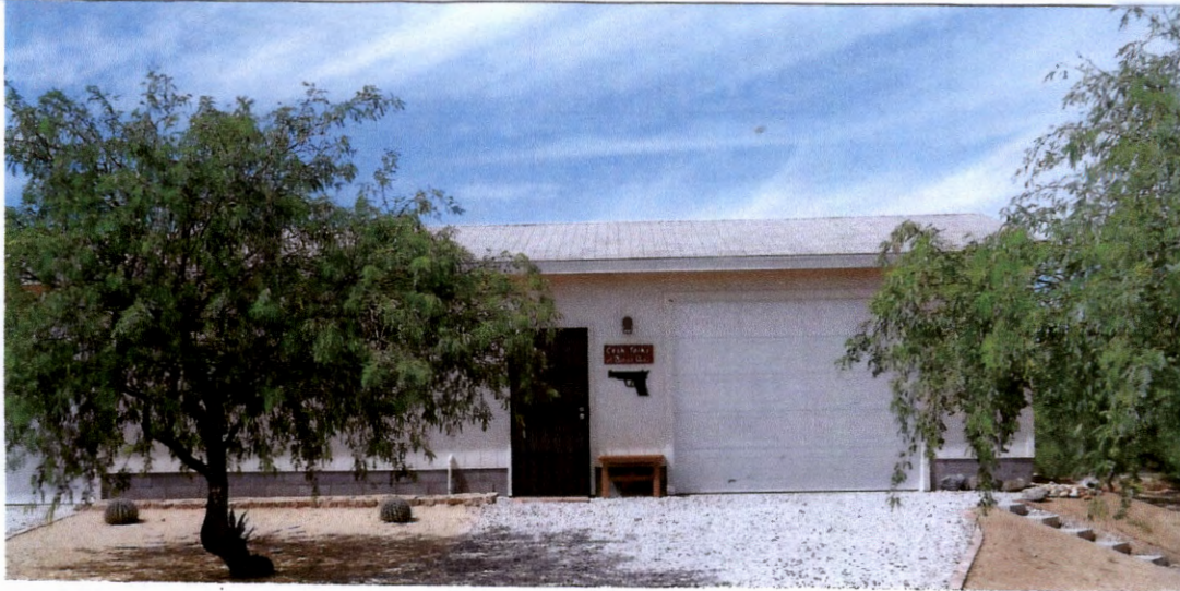
FRONT VIEW — EAST

If using the Elevation Certificate to obtain NFIP flood insurance, affix at least 2 building photographs below according to the instructions for Item A6. Identify all photographs with date taken; "Front View" and "Rear View"; and, if required, "Right Side View" and "Left Side View." When applicable, photographs must show the foundation with representative examples of the flood openings or vents, as indicated in Section A8. If submitting more photographs than will fit on this page, use the Continuation Page.