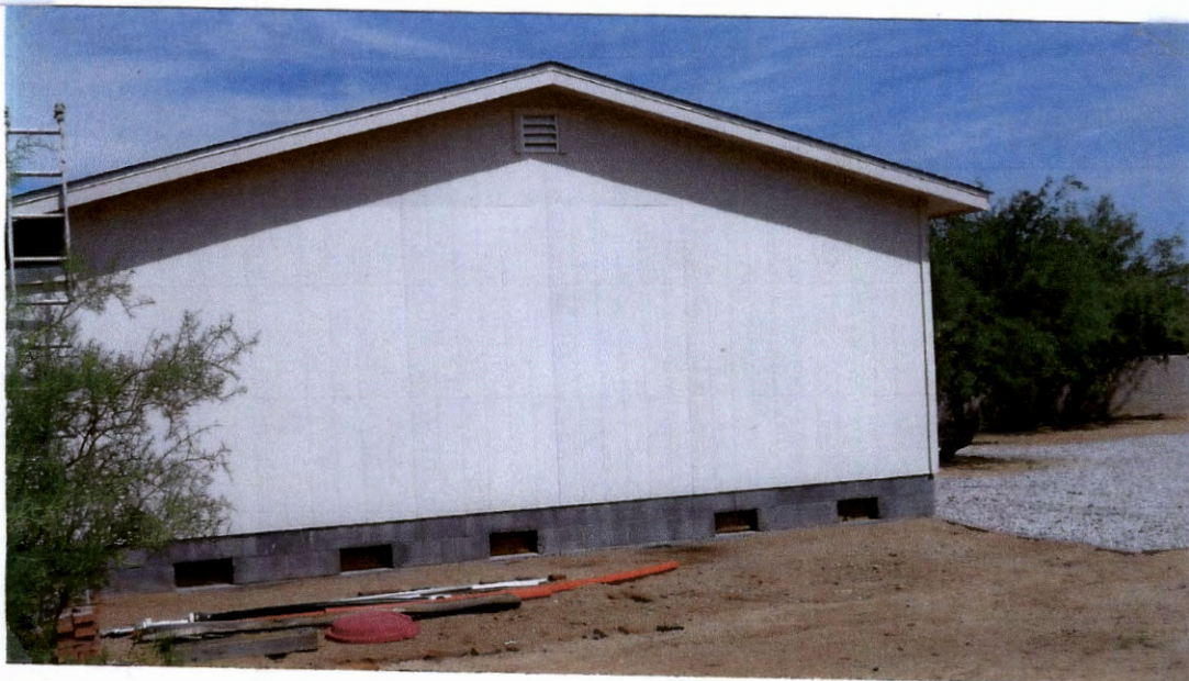
LEFT SIDE VIEW — SOUTH — 7-28-14