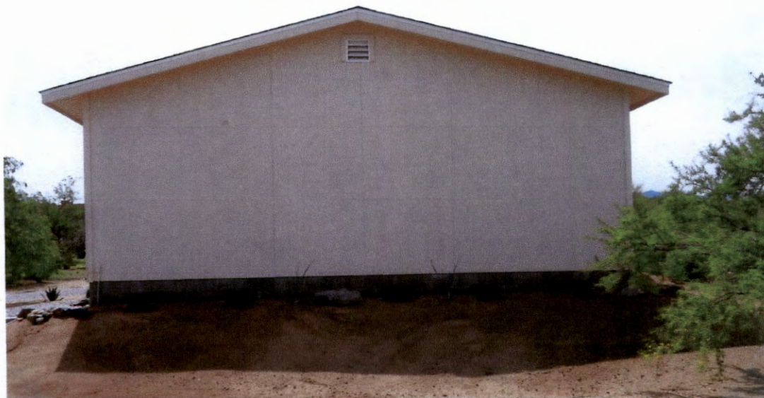
RIGHT SIDE VIEW — NORTH — 7-28-14