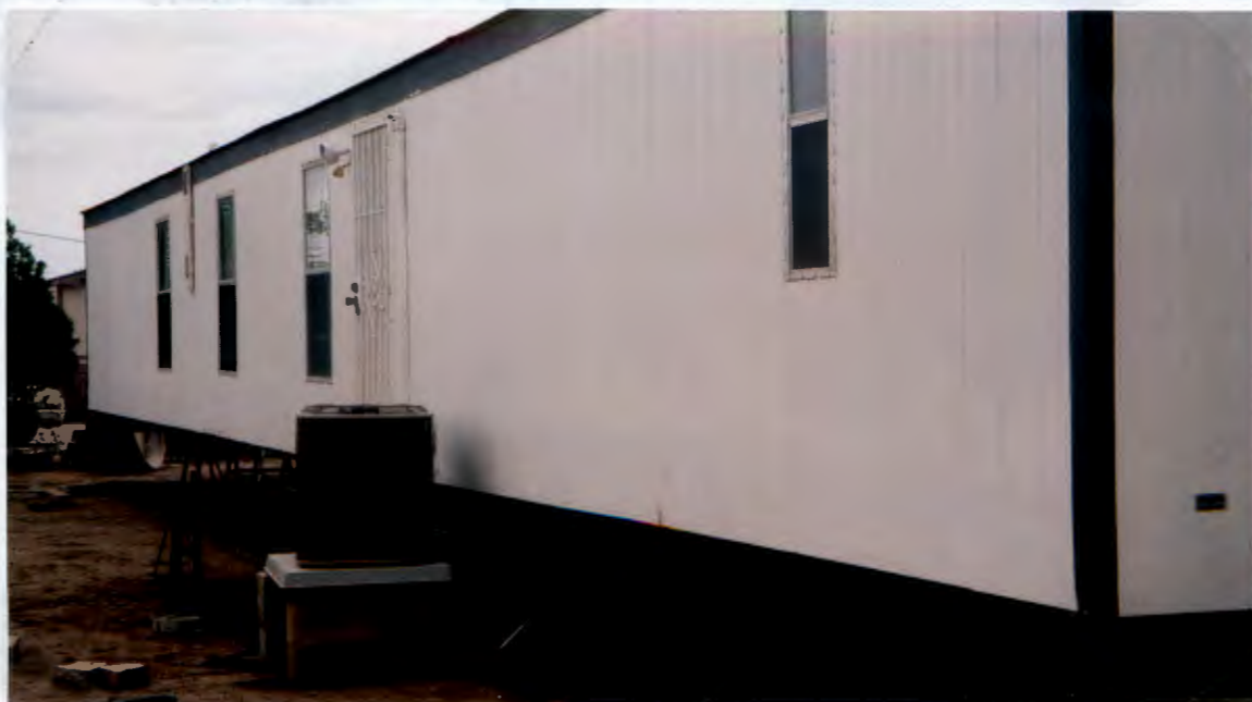
RIGHT SIDE VIEW — EAST — 9-12-11