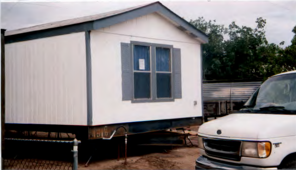
FRONT VIEW — SOUTH — 9-12-11

If using the Elevation Certificate to obtain NFIP flood insurance, affix at least Four building photographs below according to the instructions for Item A6. Identify all photographs with: date taken; "Front View" and "Rear View"; and, if required, "Right Side View" and "Left Side View." If submitting more photographs than will fit on this page, use the Continuation Page on the reverse.