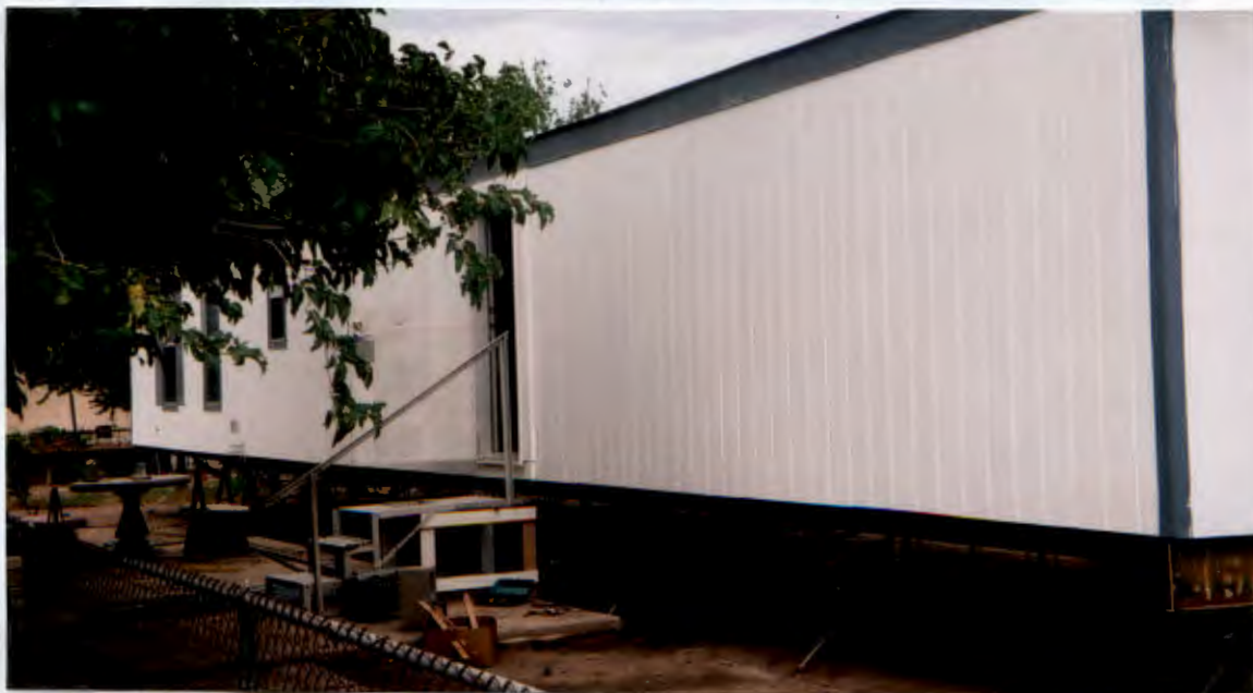
LEFT SIDE VIEW — WEST — 9-12-11