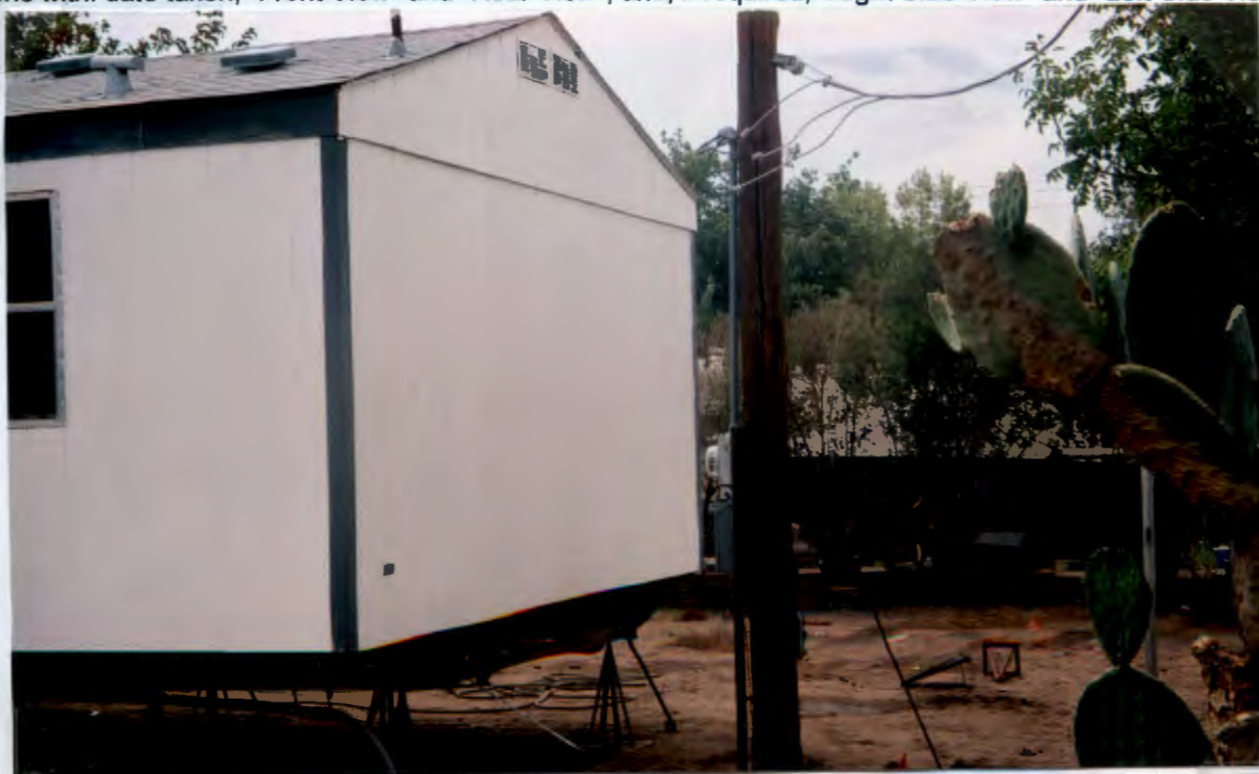
REAR VIEW — NORTH — 9-12-11

If submitting more photographs than will fit on the preceding page, affix the additional photographs below. Identify all photographs with: date taken; "Front View" and "Rear View"; and, if required, "Right Side View" and "Left Side View."