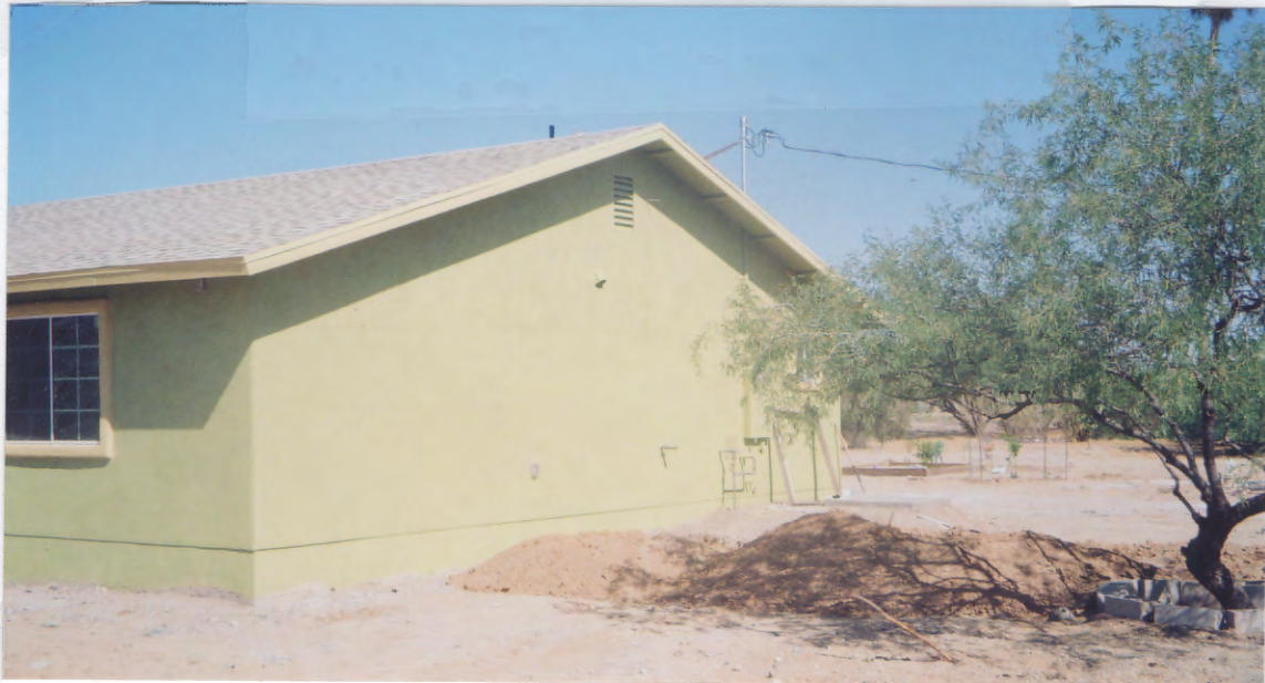
RIGHT SIDE VIEW — EAST — 5-7-12