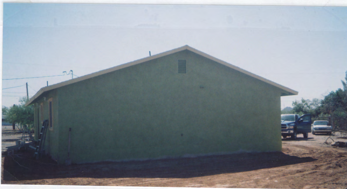
LEFT SIDE VIEW — WEST — 5-7-12