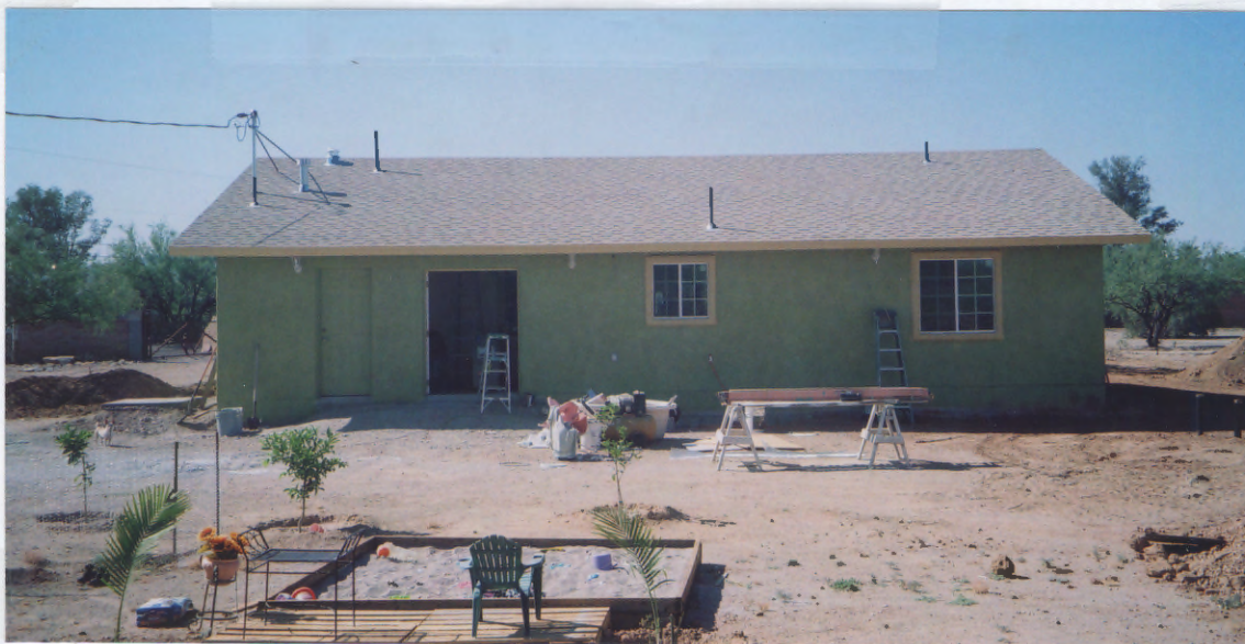
REAR VIEW — NORTH — 5-7-12

If submitting more photographs than will fit on the preceding page, affix the additional photographs below. Identify all photographs with: date taken; "Front View" and "Rear View"; and, if required, "Right Side View" and "Left Side View."