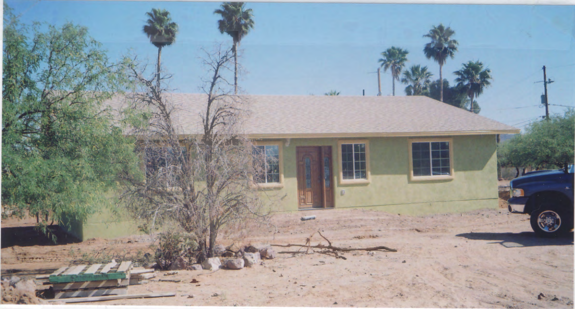
FRONT VIEW — SOUTH — 5-7-12

If using the Elevation Certificate to obtain NFIP flood insurance, affix at least Four building photographs below according to the instructions for Item A6. Identify all photographs with: date taken; "Front View" and "Rear View"; and, if required, "Right Side View" and "Left Side View." If submitting more photographs than will fit on this page, use the Continuation Page on the reverse.