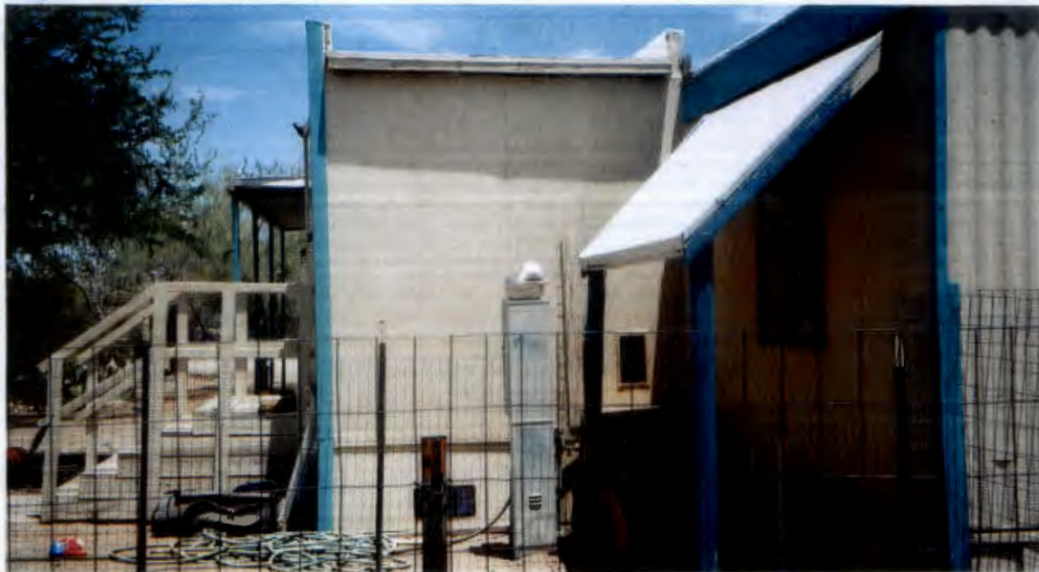
RIGHT SIDE VIEW — SOUTH — 7-19-11

NOTE: REAR VIEW IS CONNECTED TO EXIST. MOBILE HOME