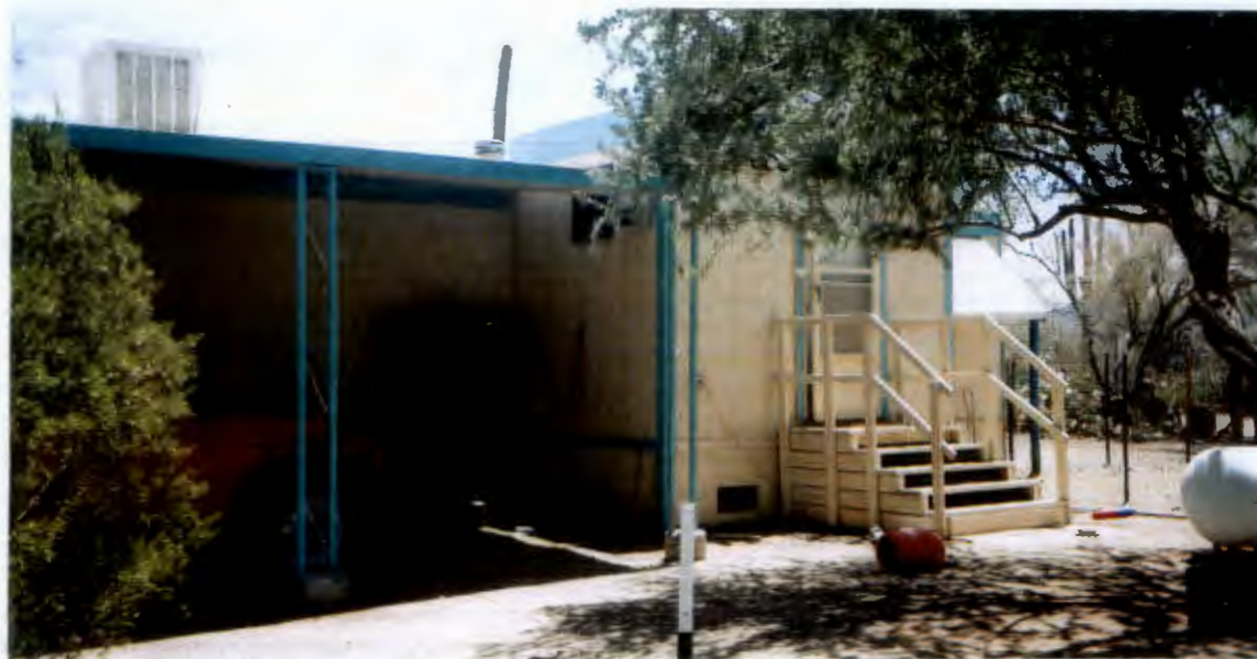
LEFT SIDE VIEW — NORTH — 7-19-11