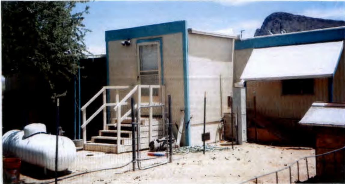
ANGLE VIEW FRONT/RIGHT SIDE—SOUTHWEST — 7-19-11

If submitting more photographs than will fit on the preceding page, affix the additional photographs below. Identify all photographs with: date taken; "Front View" and "Rear View"; and, if required, "Right Side View" and "Left Side View."