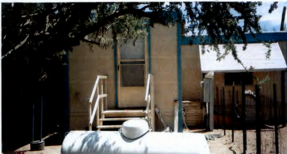
FRONT VIEW — WEST — 7-19-11

If using the Elevation Certificate to obtain NFIP flood insurance, affix at least Four building photographs below according to the instructions for Item A6. Identify all photographs with: date taken; "Front View" and "Rear View"; and, if required, "Right Side View" and "Left Side View." If submitting more photographs than will fit on this page, use the Continuation Page on the reverse.