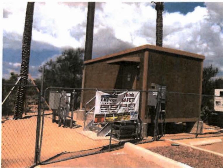
Southwest Elevation – September 5, 2012