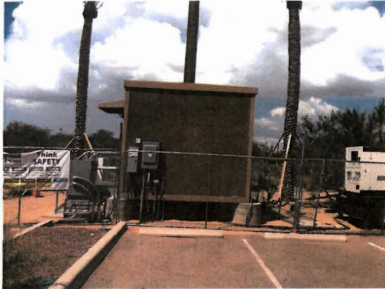
South Elevation – September 5, 2012

If using the Elevation Certificate to obtain NFIP flood insurance, affix at least 2 building photographs below according to the instructions for Item A6. Identify all photographs with date taken; "Front View" and "Rear View"; and, if required, "Right Side View" and "Left Side View." When applicable, photographs must show the foundation with representative examples of the flood openings or vents, as indicated in Section A8. If submitting more photographs than will fit on this page, use the Continuation Page.