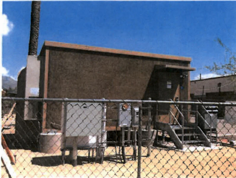
West Elevation – September 5, 2012

If submitting more photographs than will fit on the preceding page, affix the additional photographs below. Identify all photographs with: date taken; "Front View" and "Rear View"; and, if required, "Right Side View" and "Left Side View." When applicable, photographs must show the foundation with representative examples of the flood openings or vents, as indicated in Section AB.