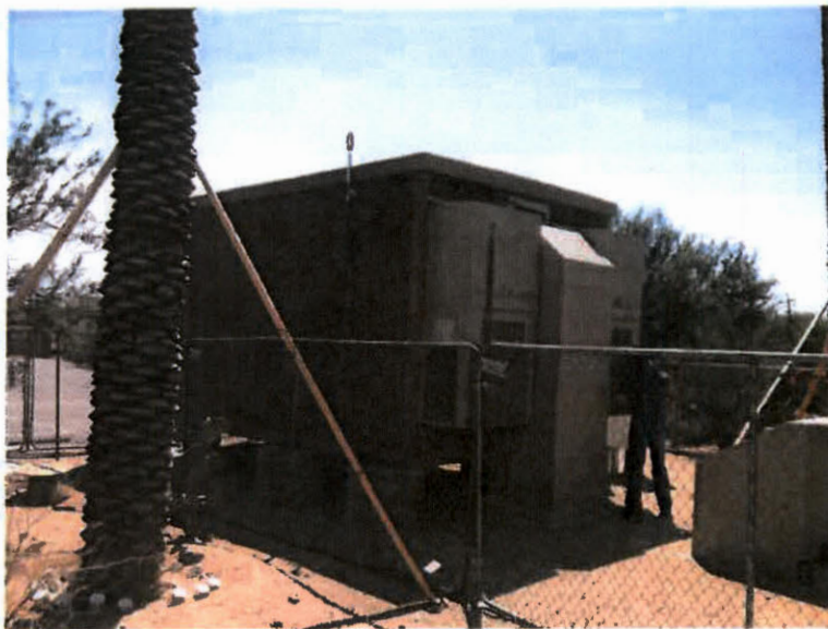
Northeast Elevation – September 5, 2012