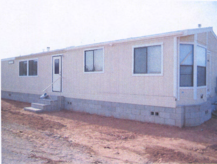
EAST & SOUTH FACE