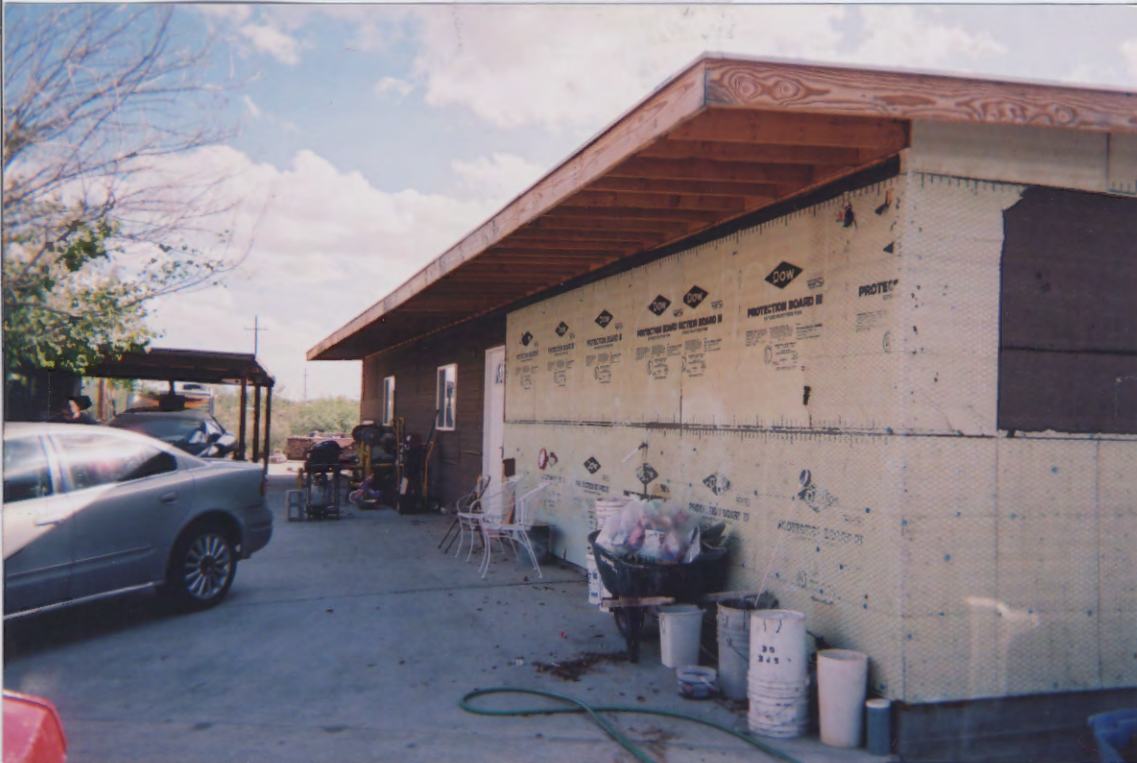
Front View 12/28/2011 D.D.R.

If submitting more photographs than will fit on the preceding page, affix the additional photographs below. Identify all photographs with: date taken; "Front View" and "Rear View"; and, if required, "Right Side View" and "Left Side View."