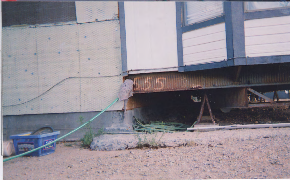
Rear View 12/28/2011 Attached to existing trailer