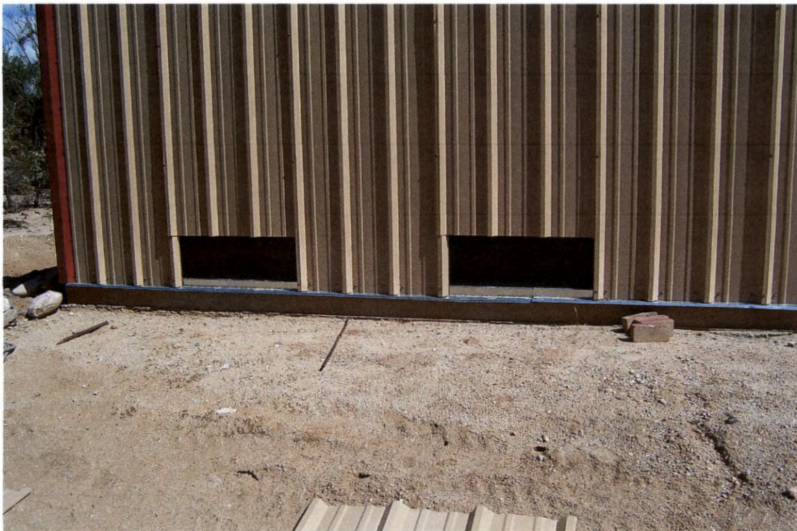
Looking Northeast - Close Up of Flood Vents