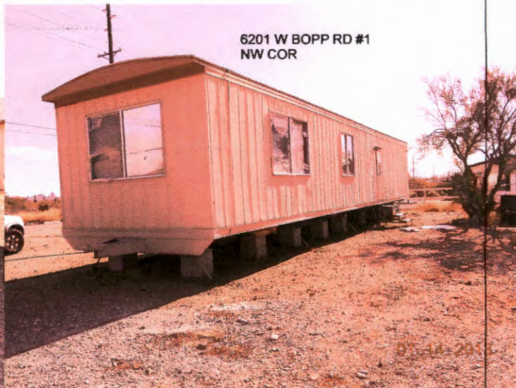
6201 W BOPP RD #1 NW COR