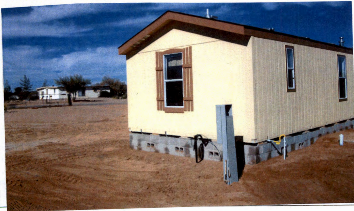
Right Side (South)