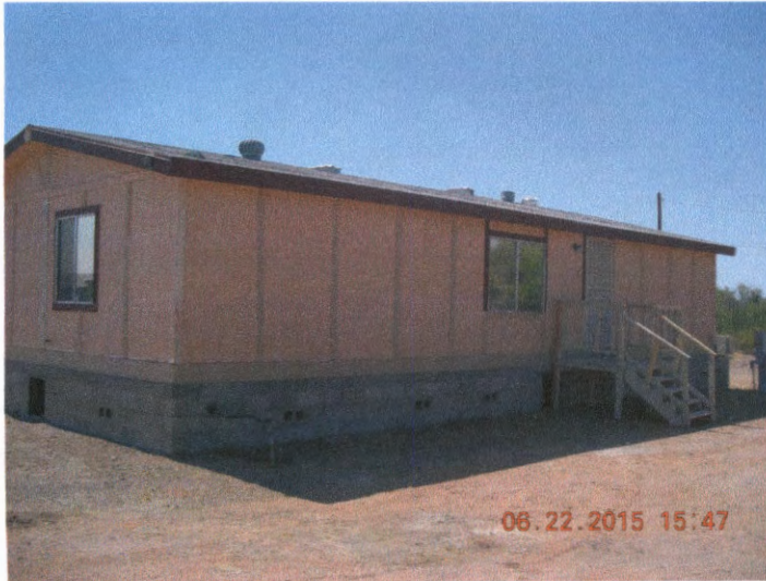
East Face Front Entrance of Residence