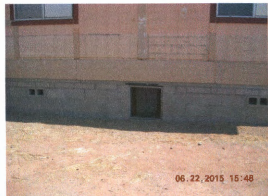
Detail: Crawl Space Access (North Face of Residence)