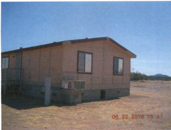
North Face Side of Residence