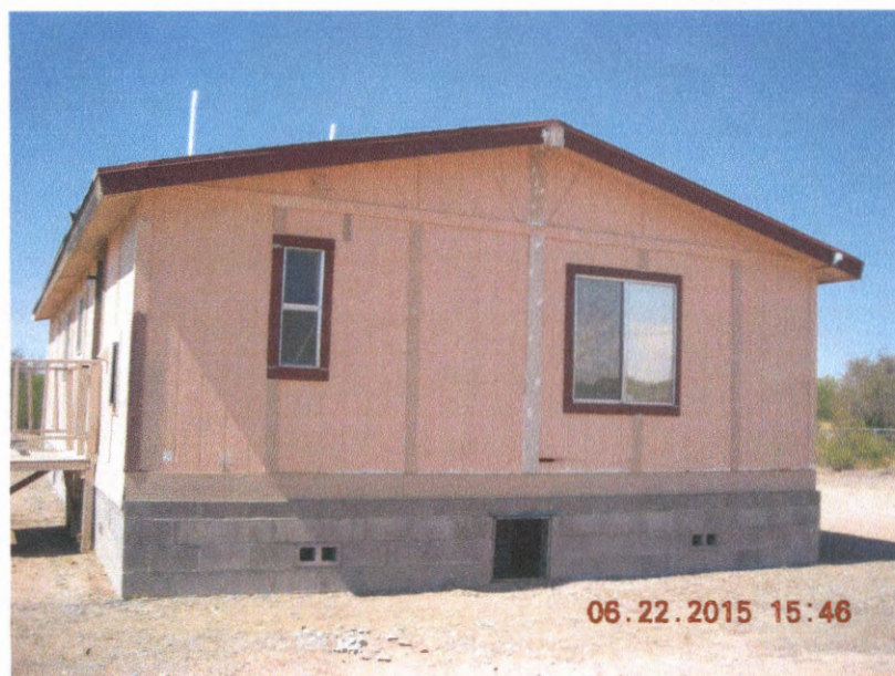
South Face Side of Residence