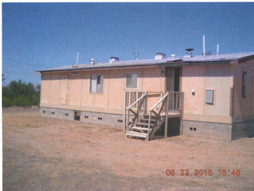
West Face Rear Entrance of Residence