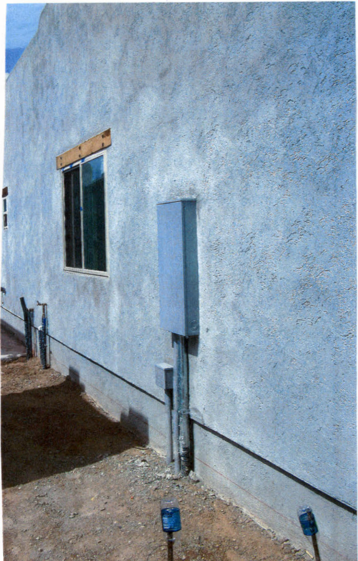
Right side new addition