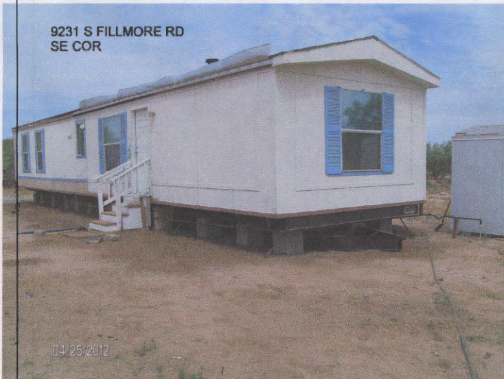
9231 S FILLMORE RD SE COR